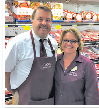
Win 1 of 2 Free $50 Beef Certificates from Don's Food Center