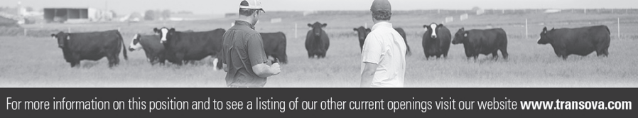
For more information on this position and to see a listing of our other current openings visit our website www.transova.com