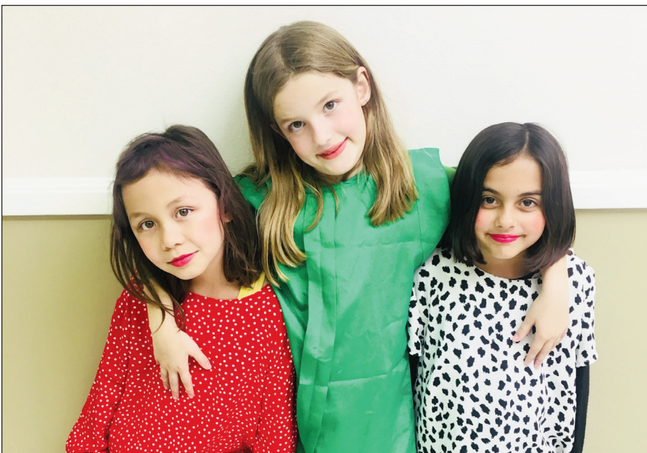
Willow Glen Children's Theatre cast members dressed up for a WGCT production.