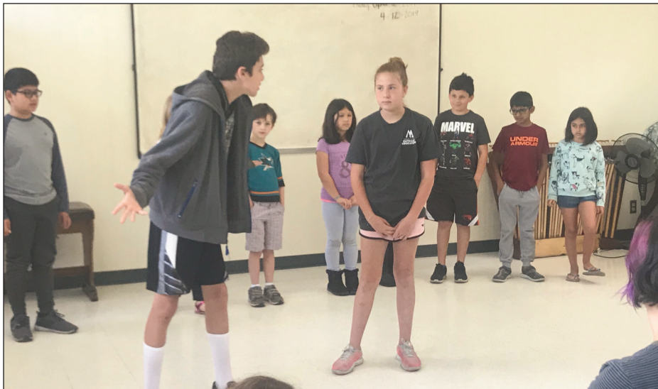
Willow Glen Children's Theatre cast members and staff in rehearsal for "The Book of Beautiful Things."