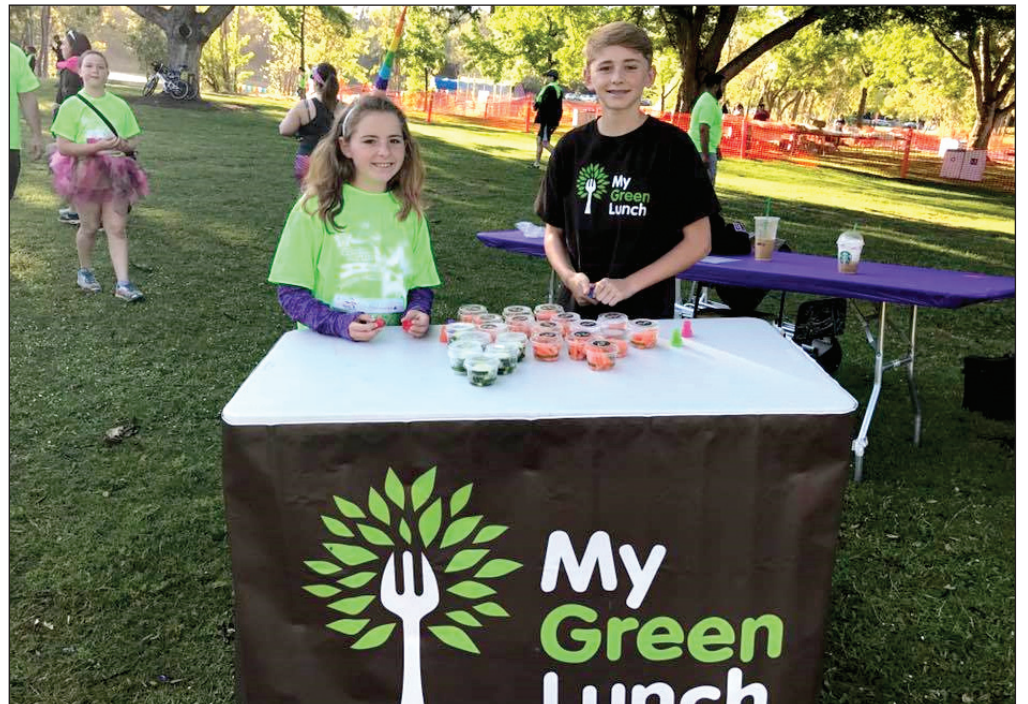
MyGreenLunch recently hosted a booth at Girls on the Run at Vasona Park.

"Most of our foods and ingredients are purchased from California farms and local food