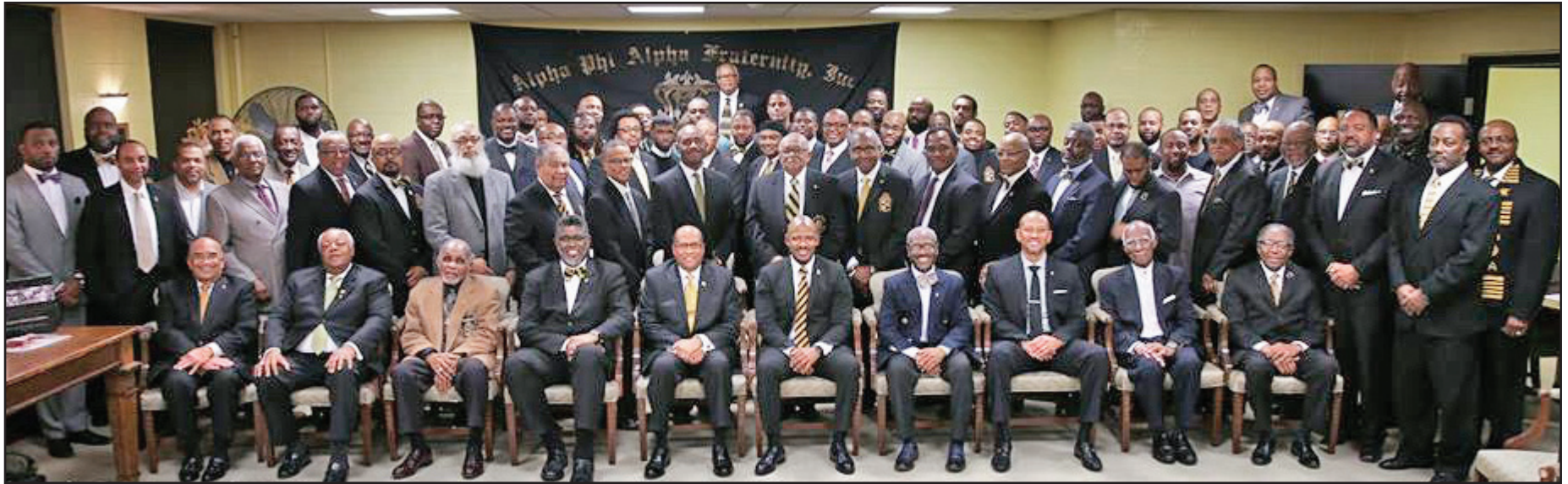
People from across the nation will gather on Saturday, May 18, 2019 at the Marriott Waterfront Hotel in Baltimore to celebrate the Delta Lambda Chapter of Alpha Phi Alpha Fraternity's centennial. With nearly 200 active members, Delta Lambda is the oldest, highly regarded and largest alumni chapter in Maryland. (Above) Alumni of Delta Lambda Chapter of Alpha Phi Alpha Fraternity, Inc. in 2017