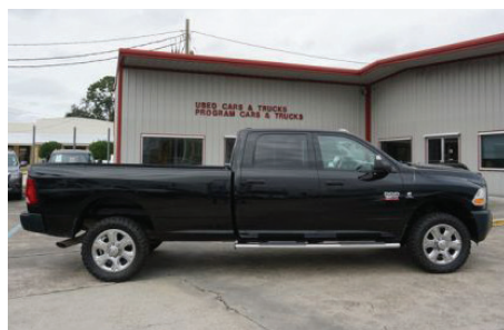
12 RAM 3500 ST #8T0385B.....$31,997

FIND THE GARAGE SALE YOU'VE BEEN LOOKING FOR! GO TO HOUMAWEEKLY.COM FOR AN ONLINE MAP