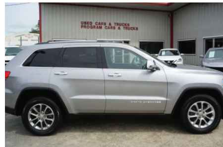
14 Jeep Grand Cherokee Limited #9J0141A.....$18,997