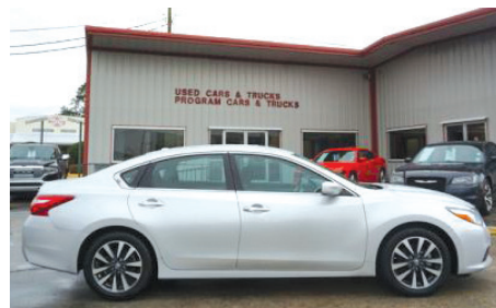
17 Nissan Altima 2.5 #11042.....$14,997