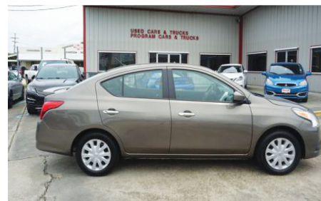
17 Nissan Versa S #11118.....$11,997