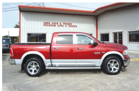
14 RAM 1500 Laramie #8T0569A.....$20,997