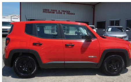
15 Jeep Renegade Sport #9J0069A.....$12,997