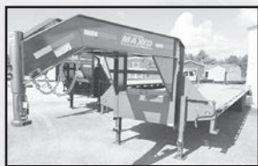
Gooseneck Trailers - Up to 44 Ft. Long