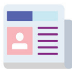
Local News Advertising

Adtaxi is a client-centric organization that brings scale, precision, and sophistication to digital marketing. Leveraging the belief that people matter as much as technology, we help automotive dealerships solve complex marketing challenges with custom, performance-driven solutions.