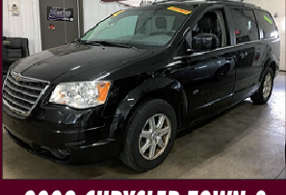
2008 CHRYSLER TOWN & COUNTRY TOURING DRIVER SIDE HD MIRROR, STABILITY/TRACTION CONTROL, 3RD ROW SEATING, 109K MILES $6,995