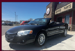
2005 CHRYSLER SEBRING TOURING CONVERTIBLE, LEATHER, ALLOY WHEELS, 5117K MILES $3,995