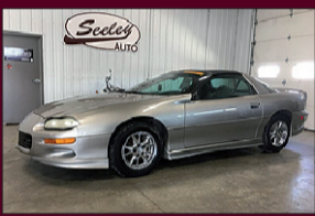
2002 CHEVROLET CAMARO BUCKET SEATS, CLOTH, SWEET RIDE!! 173K MILES $4,495