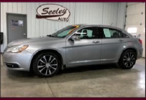
2013 CHRYSLER 200 LIMITED FLEX-FUEL, SIRIUS XM RADIO, LEATHER, STABILITY/TRACTION CONTROL, 91K MILES $8,495