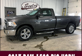
2017 RAM 1500 BIG HORN 4WD, BUCKET FRONT SEATS, HITCH, SIRIUS XM RADIO, TRACTION/STABILITY CONTROL, 172K MILES $13,495