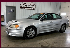
2003 PONTIAC GRAND AM GT TRACTION CONTROL, REAR SPOILER, BUCKET SEATS, CLOTH, 118K MILES $3,995