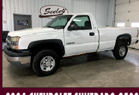
2004 CHEVROLET SILVERADO 2500 SPLIT-BENCH FRONT SEAT, STEEL WHEELS, DAYTIME RUNNING LIGHTS, 176K MILES $4,995