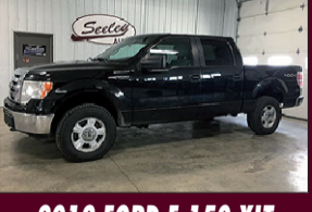
2012 FORD F-150 XLT FRONT SIDE CURTAIN AIRBAGS, 4WD, STABILITY/TRACTION CONTROL, BLUETOOTH, 143K MILES $13,995