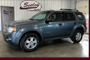
2011 FORD ESCAPE XLT FLEX-FUEL, SIRIUSXM RADIO, 12V POWER OUTLET, CLOTH, 132K MILES $6,995