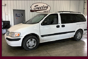
2000 CHEVROLET VENTURE LS A PRICE THAT'S EASY ON THE WALLET AND AN INTERIOR THAT'S GENEROUS ON SPACE, WITH *ONLY 92382 MILES! $3,595