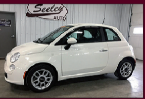
2012 FIAT 500 POP HATCHBACK, SIDE CURTAIN AIRBAGS, CLOTH, 83K MILES $5,595