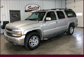
2006 CHEVROLET SUBURBAN LS 1500 5L, V8, FLEX-FUEL, 4WD, STABILITY/TRACTION CONTROL, 223K MILES $6,995