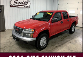
2006 GMC CANYON SLE CREW CAB, 4WD, BUCKET FRONT SEATS, CHILD SEAT ANCHORS, 174K MILES $6,995