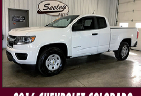
2016 CHEVROLET COLORADO EXCELLENT WORK TRUCK, FRONT ASSIST, STABILITY/TRACTION CONTROL, SIDE CURTAIN AIRBAGS, 101K MILES $10,995