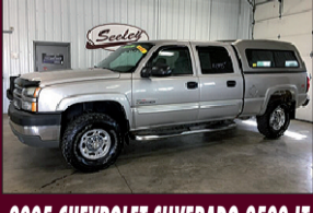
2005 CHEVROLET SILVERADO 2500 LT CREW CAB, 4WD, BUCKET FRONT SEATS, ONSTAR, 230K MILES $11,995