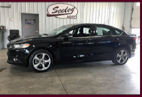
2016 FORD FUSION SE PANDORA APP, SIRIUS XM RADIO, CLOTH, STABILITY/TRACTION CONTROL, 105K MILES $9,995