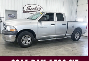
2011 RAM 1500 SLT 4WD, 12V POWER OUTLET, STABILITY/TRACTION CONTROL, SIRIUSXM, 198K MILES $7,995