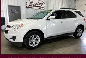
2013 CHEVROLET EQUINOX LT SIRIUSXM, 4WD, STABILITY/TRACTION CONTROL, ONSTAR, 127K MILES $8,995