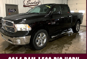
2014 RAM 1500 BIG HORN 4WD, STABILITY/TRACTION CONTROL, BLUETOOTH, REMOVABLE TAILGATE, 136K MILES $15,995