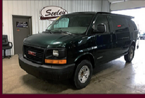
2006 GMC SAVANA 2500 DAYTIME RUNNING LIGHTS, BUCKET FRONT SEATS, BARN REAR DOOR, 256K MILES $5,995