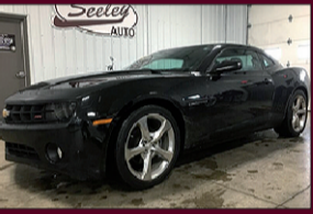
2013 CHEVROLET CAMARO RS SIRIUS XM RADIO, LEATHER, HEATED SEATS, STABILITY/TRACTION CONTROL, 145K MILES $11,995