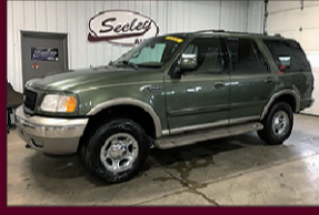
2000 FORD EXPEDITION EDDIE BAUER 4WD, LEATHER, 3RD ROW, CHROME WHEELS, 157K MILES $3,995