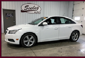
2012 CHEVROLET CRUZE LT SIRIUS XM, STABILITY/TRACTION CONTROL, BLUETOOTH, ONSTAR, 2-12V POWER OUTLETS, 103K MILES $7,295