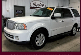
2006 LINCOLN NAVIGATOR 5L, V8, 4WD, LEATHER, 3RD ROW SEATING, STABILITY/TRACTION CONTROL, 158K MILES $7,495