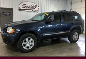
2010 JEEP GRAND CHEROKEE LAREDO 5.7L, V8, 4WD, HEATED MIRRORS, STABILITY/TRACTION CONTROL, 190K MILES $6,995