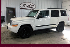
2008 JEEP COMMANDER SPORT 3.7L, V6, SIRIUSXM, 4WD, STABILITY/TRACTION CONTROL, CLOTH, 160K MILES $7,995