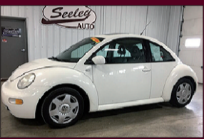
2001 VOLKSWAGEN BEETLE GLX LEATHER, TRACTION CONTROL, MOONROOF/SUNROOF, 139K MILES, SPORTY!! $4,995