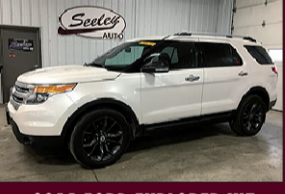
2011 FORD EXPLORER XLT 3.5L, V6, SIRIUSXM, STABILITY/TRACTION CONTROL, BLUETOOTH, 107K MILES $13,995