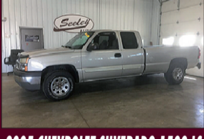
2005 CHEVROLET SILVERADO 1500 LS EXTENDED CAB, 4WD, DAYTIME RUNNING LIGHTS, HEATED MIRRORS, 167K MILES $6,995