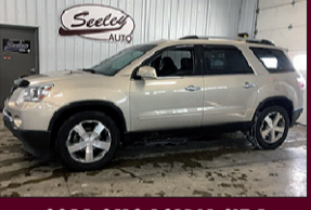
2011 GMC ACADIA SLT-1 3.6L, V6, SIRIUSXM, FRONT SIDE CURTAIN AIRBAGS, 3RD ROW SEATING, 118K MILES $10,595