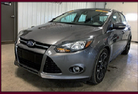
2012 FORD FOCUS TITANIUM SIRIUS XM, CLOTH, STABILITY/TRACTION CONTROL, BLUETOOTH, 99K MILES $8,495