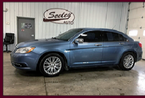
2011 CHRYSLER 200 LIMITED FLEX FUEL, SIRIUS XM RADIO, FRONT SIDE CURTAIN AIRBAGS, STABILITY/TRACTION CONTROL, 139K MILES $6,495