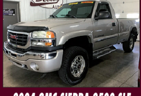
2004 GMC SIERRA 2500 SLE STANDARD CAB, 4-WHEEL ABS, HEATED MIRRORS, CLASSY!, 75K MILES $10,595