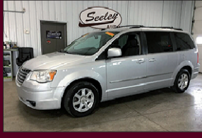
2009 CHRYSLER TOWN & COUNTRY TOURING STABILITY/TRACTION CONTROL, SIRIUS RADIO, POWER OUTLET, 163K MILES $5,995