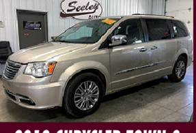
2013 CHRYSLER TOWN & COUNTRY TOURING-L FLEX FUEL, SIRIUS RADIO, STABILITY/TRACTION CONTROL, BLUETOOTH, 154K MILES $9,995