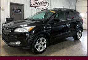
2013 FORD ESCAPE SE 2.0L TURBO, SIRIUSXM, 4WD, CLOTH, STABILITY/TRACTION CONTROL, 134K MILES $9,995