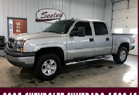
2005 CHEVROLET SILVERADO 1500 LS CREW CAB, 4WD, DAYTIME RUNNING LIGHTS, ALLOY WHEELS, 191K MILES $8,995