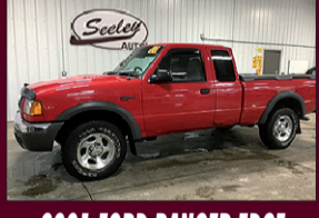
2001 FORD RANGER EDGE 4WD, SUPERCAB, SPLIT-BENCH FRONT SEAT, STEEL WHEELS, 221K MILES $3,995