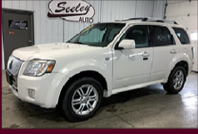
2009 MERCURY MARINER PREMIER V6, SIRIUSXM, STABILITY/TRACTION CONTROL, LEATHER, 134K MILES $5,995