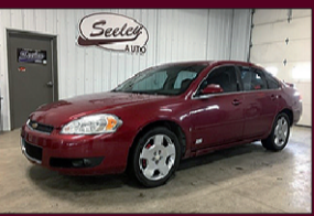
2008 CHEVROLET IMPALA SS SIRIUS XM RADIO, REAR SPOILER, LEATHER, STABILITY/TRACTION CONTROL, 171K MILES $5,995