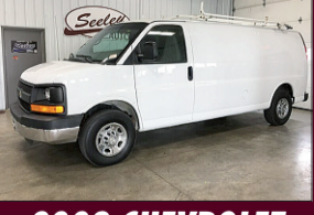
2008 CHEVROLET EXPRESS 2500 FLEX-FUEL, 12V FRONT POWER OUTLET, BARN REAR DOOR, 136K MILES $9,995

Always Accepting Trade-Ins See Many More At: www.seeleycars.com