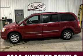
2010 CHRYSLER TOWN & COUNTRY TOURING SIRIUS RADIO, POWER OUTLET, THIRD ROW SEATING, STABILITY/TRACTION CONTROL, 137K MILES $7,495