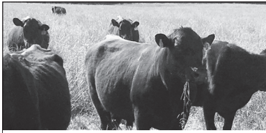
Cattle sell first at 9:00 A.M.

40+ Cow/Calf Pairs, all with 1st calves by side, black with 1/8 to 3/8 Holstein X, calf raisers! 15 BWF Yearling Heifers, open, ready to breed 15 Hereford Yearling Heifers, open, ready to breed 1 Purebred Angus Bull, 3 yrs. old • 1 Purebred Hereford Bull, 3½ yrs. old Tractors • Trucks • Trailers • Backhoe • Farm Equipment • Etc.