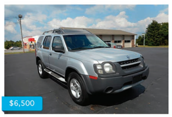
actual car on Exchange931.com

22 local auto dealers have their inventories from new to used on our website www.Exchange931.com.