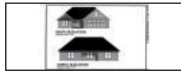
130 North Port Ln, Huron, OH 44839 Erie County $229,900

Under Construction Home in the Newly Redesigned North Port Subdivision! 3 bedroom, 2 bath home with an open floor plan designed for entertaining! At the end of the lane you will see water views and have access to the marina. This is the perfect place to call home located centrally in Huron. Purchase before the home is complete to pick your own finishes. Estimated completion fall 2019. Model home is pictured.