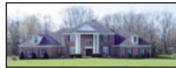
643 Hasbrock Rd, Norwalk, OH 44857-8933 Huron County $459,900

Are you looking for that special home? This 4 bedroom, 4 1/2 bath 2 story Georgian Colonial style home is suit to impress. Featuring a gourmet kitchen with cherry cabinets, granite counter tops, tile floors, newer carpeting, fresh paint, high ceiling, and a private office. Large first floor master bedroom suite with large master bath. This home is ready to move in! includes an oversized 3 car garage, two furnaces, outside covered patio with fireplace.