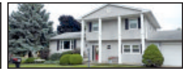
1308 Melody Ln, Sandusky, OH 44870-5604 Erie County $174,900

Lovely 4 bed 2.5 bath located on the end of the cul-de-sac in Westchester Estates. Outstandingly well-maintained, beautiful landscaping all around the house, updated bathrooms, formal dining room, and two separate family rooms. This house is abundant in space inside and out with over 1800 SQ FT and .43 of an acre. Home warranty included! Two car attached garage, Perkins school district.