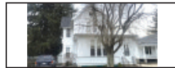
4 Newton St, Norwalk, OH 44857-1412 Huron County $147,900

Large century home with 5 bedrooms and spacious rooms throughout! 2 Full baths and 2 car detached garage with a walk-up attic for extra storage. Separate formal dining. Charming enclosed front porch and covered side and back porches. Large back patio. Fenced yard and laundry on your main level. Within walking distance to downtown. First American Home Warranty included!