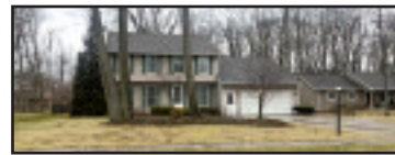
135 Fairway Cir, Norwalk, OH 44857-1902 Huron County $234,900

Located in scenic Sycamore Hills subdivision, this 4 bedroom, 2 full baths and 2 half baths has many upgrades. Beautiful kitchen with granite counter tops and oversized window looking out to the large fenced-in back yard. Built-ins and fireplace in living room and jetted tub in master bath. Large deck, formal dining room, extra wide concrete drive, 2 car attached garage, and partially finished basement for extra living space! Immediate possession.