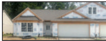
67-B Grassland, Norwalk, OH 44857 Huron County $222,900

Currently under construction and located in the Two Meadows Subdivision. Come experience the condominium lifestyle! The new Hampton 3 Model unit features three bedrooms and two baths, large walk-in closet and master suite, a 2 car garage and an open floor plan. Customize this home to your preference by choosing your own colors, cabinets, appliances, and flooring! Unit located on the pond with a view.