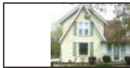
18 W Main St, Berlin Heights, OH 44814-9688 Erie County $148,000