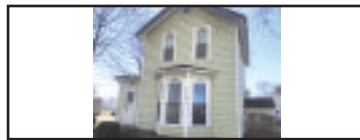
71 Baker St, Monroeville, OH 44847-9787 Huron County $89,900

Affordable home in Monroeville ready for new owners! 2 car detached garage, large lot with convenient location near schools. Low maintenance vinyl siding with first floor mud/laundry room. Extra high ceilings.