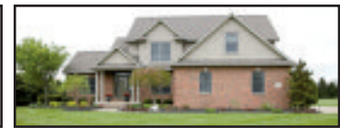
25 Oakfield Dr, Milan, OH 44846-9486 Erie County $395,900

This stunning 4 bedroom brick home located in Twin Oaks was made for entertaining! Located on quiet cul-de-sac close to the high school, with 2,610 SQ. FT., an in-ground heated pool with a pool house and extra half bath to keep the mess outside! Pool includes LED lights, bromine system, french drain along perimeter, and high pressure underground plumbing. Exterior also boasts an outside stone fire pit. One of a kind floor plan, 6 panel doors, and custom finishes throughout. Kitchen includes beautiful cupboards, granite counter tops, newer appliances, and built-in desk. Custom floor-to-ceiling custom stone fireplace in living room. Master suite includes upstairs laundry, soaker tub and beautiful finishes. Full finished basement with cargo access in garage and sauna! 3 car garage with extra storage shelving. Whole home air humidifier and purifier. Professional landscaping by All Styles and lawn regularly treated.