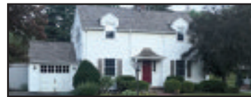
138 Park Ave, New London, OH 44851-1128 Huron County $149,900

Price reduced! Quaint 4 bedroom 1.5 bath home located on a private, serene lot. Functional eat-in kitchen. Separate family and living rooms, formal dining room, 3 seasons room and outside patio provide plenty of entertaining and living space. This house certainly has charm! Parquet and hardwood floors in some rooms, built-in bookcases and a fireplace in living room. All 4 bedrooms and full bath are located on the second floor. Creek behind home. Full basement and 1 car garage. Immediate Possession!