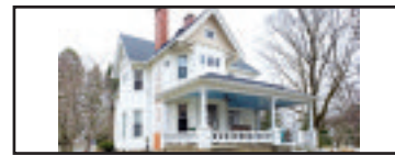
164 Center St, Milan, OH 44846 Erie County $274,900

Spacious 2 story 5 bedroom, 2.5 bath Victorian Century Home. GREAT location in a stone's throw away from the elementary school. Tastefully remodeled bathrooms, some new carpeting and fresh paint. Partially finished basement with wet bar and fireplace. Beautiful woodwork and tall ceilings. Large open front porch and covered back porch. Great sized lot with nearly 3/4 of an acre! Large 2 story 24x36 heated barn. Newer commercial roof with a 50 year warranty!!! Vinyl siding. Immediate possession. Central air and two furnaces.