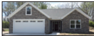
132 North Port, Huron, OH 44839 Erie County $224,900

Under Construction Home in the Newly Redesigned North Port Subdivision! 3 bedroom, 2 bath home with an open floor plan designed for entertaining! At the end of the lane you will see water views and have access to the marina. This is the perfect place to call home located centrally in Huron. The interior and yard pictures featured are pictures of another home completed by this builder in this development. This is not a representation of the finishes being completed at this address, but an example of the finishes which could be done.