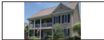
31 Twin Oaks Dr, Milan, OH 44846-9482 Erie County $399,900

Located at the end of the cul-de-sac in Twin Oaks, this beautiful 4 bedroom 2 story home boasts 2530 SQ FT and a 1.21 acre lot. This house has been extremely well maintained and updated with custom neutral touches. Absolutely stunning master suite with large walk-in closet, custom tiled bath with stand up shower, soaker tub and heated floors. Windowed breakfast nook with bench seating overlooks entertainers back yard with a concrete patio and heated in-ground pool. Gas fireplace, attached extra deep 2 car heated garage & shed for extra storage space. Tiled second story balcony for those morning cups of coffee. Finished, full basement for extra living area. Must see in person!