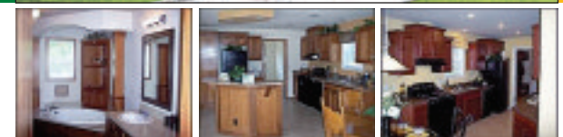
Forest River Housing – Model #156 with optional porch. 3BR, 2B home

Work with our knowledgeable sales staff to assist you in selecting the home that fits your needs & lifestyle.