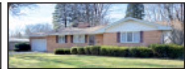
43 Breezewood Dr, Norwalk, OH 44857-2441 Huron County $159,000

Quality brick ranch in a quiet neighborhood - great location! Great floor plan with an eat-in kitchen and plenty of cabinet space. Master has it's own private bath. This house is in great shape, clean, and has plenty of windows for natural light. 2 fireplaces and large closets throughout. Family room and kitchenette in basement. 2 car detached garage and patio. Gas forced air with central air-conditioning. Immediate possession and First American Home Warranty included!