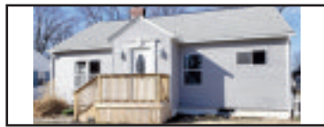
58 Christie Ave, Norwalk, OH 44857-2304 Huron County $174,900

Remodeled home on Christie Avenue with great proximity to the school! This home boasts 5 bedrooms, 2 1/2 bathrooms, plenty of natural light, a large master suite with custom tiled shower w/ marble inlay, beautiful hardwood floors, new windows, large deck overlooking the tennis courts, and full basement. Fresh carpet upstairs and fresh paint throughout. Custom cabinets and hard surface counter tops. Breakfast nook off kitchen and attached one car garage. The list goes on! This home will not disappoint. Additional bath in basement.