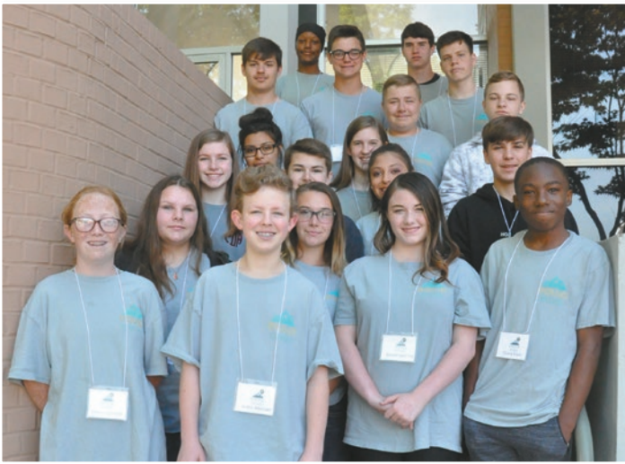
The Chamber's Equip Student Leadership program is geared towards eighth grade students who are interested in career paths in the skilled trades or careers requiring a two-year degree.