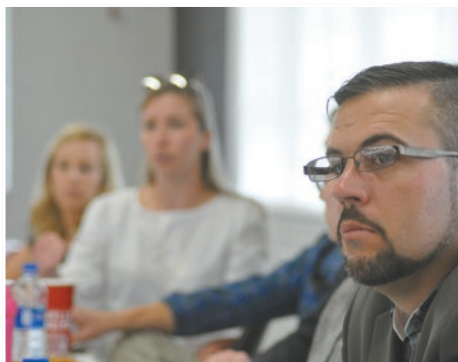
Young professionals play a critical role in the residential development conversation as key stakeholders, being the next generation of leaders in Decatur-Morgan County and positioning themselves to benefit from the forecasted job growth in north Alabama.