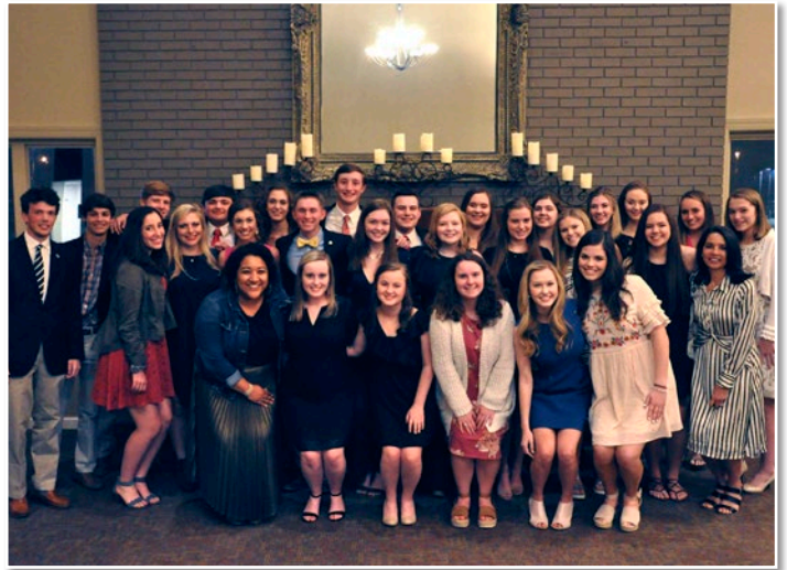
Edge Student Leadership is an annual eight-month program featuring high schools students from across Morgan County.