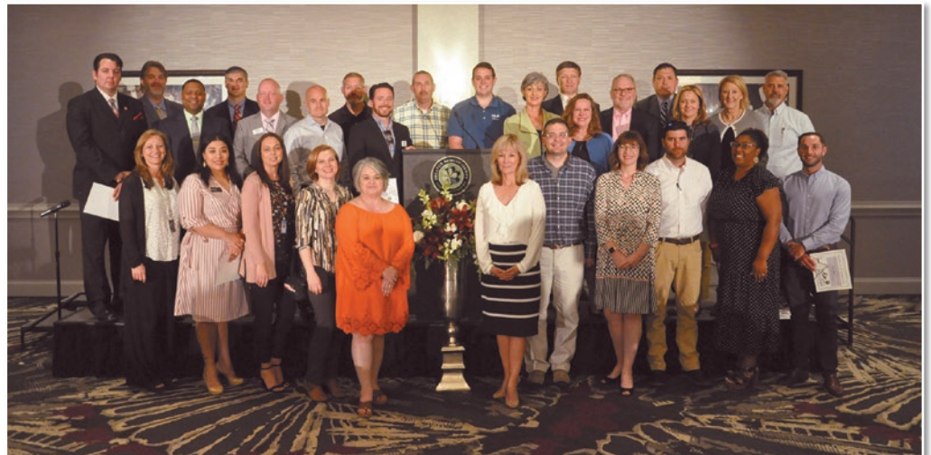
The Small Business Awards Celebration serves as "graduation" for the Chamber's 10-month Excellence in Leadership program.