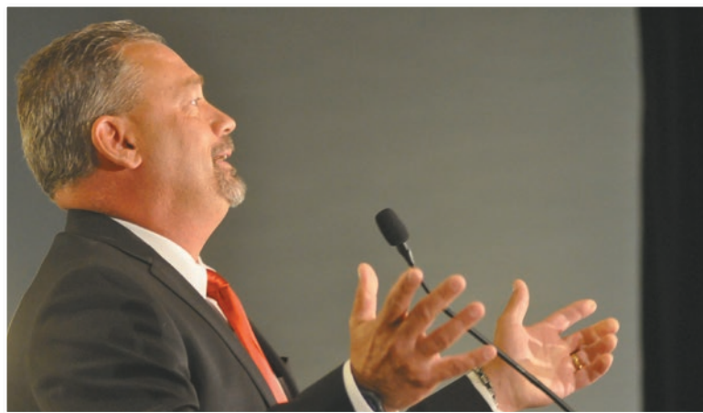
Lubisco started Entrusted Tees as a side business in 2011, and has since grown it to be one of the largest promotional item companies in the southeast.