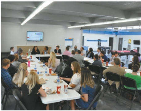
More than 40 young professionals gathered in April to discuss the need for residential development as part of the Chamber’s YP Leadership Luncheon.

homes in developed neighborhoods. Thousands of jobs are coming to our region in the next several years, and our area needs to be prepared to receive them and have them plant roots and become part of our community. We are thankful for the engagement of the young professionals in our community and their enthusiasm for the development of a long-range strategy for homebuilding in Decatur-Morgan County.