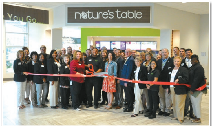
Nature's Table in the Cook Museum of Natural Science 133 Fourth Avenue NE, Decatur • (256) 351-4505 www.cookmuseum.org