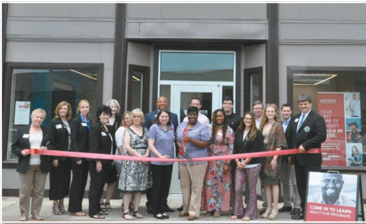
Strayer University 305 Second Avenue SE, Decatur • (256) 686-5850 www.strayer.edu