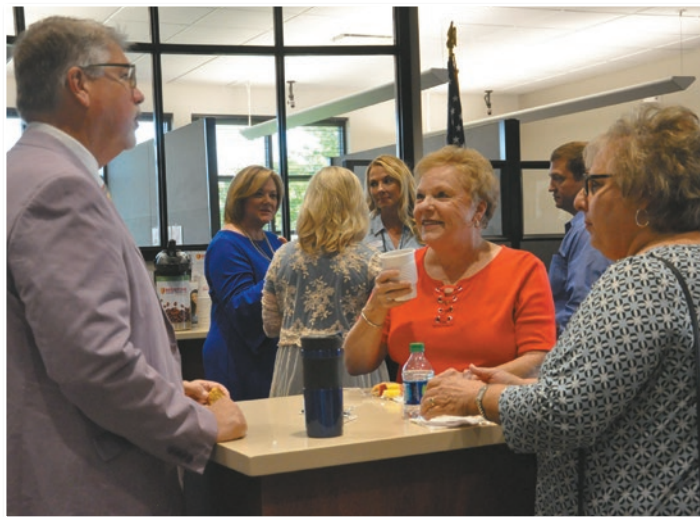
More than 40 members attended the Coffee & Cards networking event, hosted by Redstone Federal Credit Union on Sixth Ave. in Decatur.