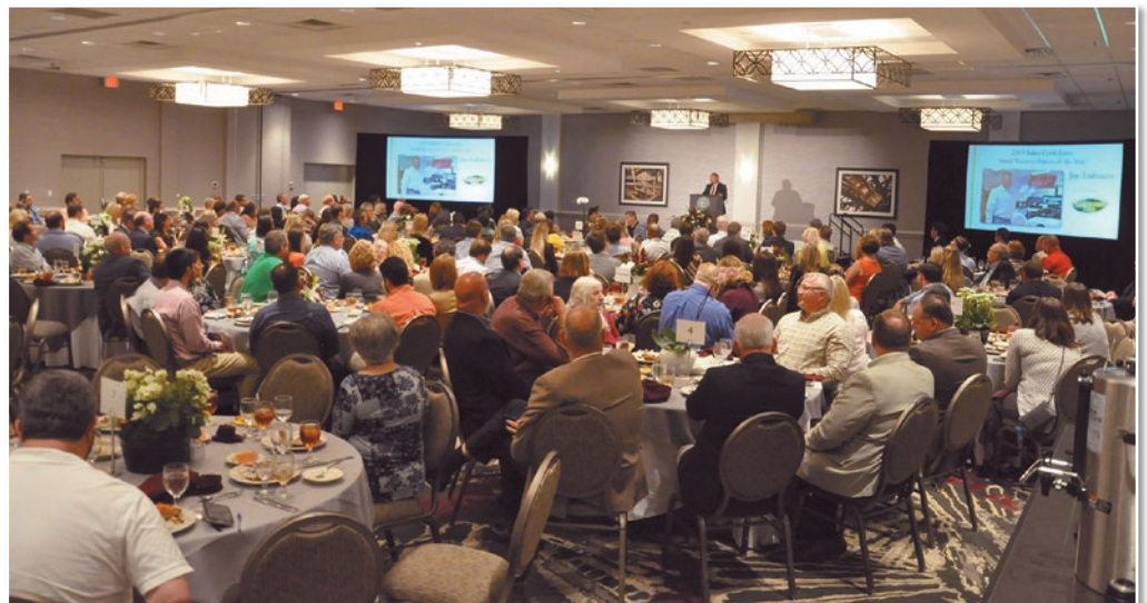
More than 200 people attended the Chamber's annual Small Business Awards Celebration.