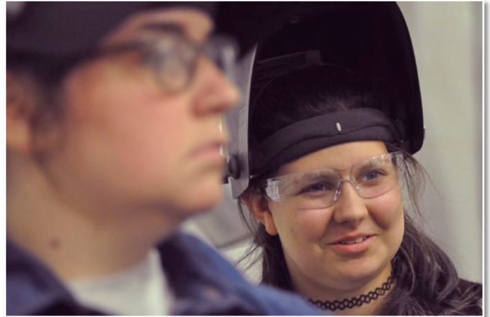
Since beginning the program 13 years ago, more than 360 students have graduated from SWeETy Camp.