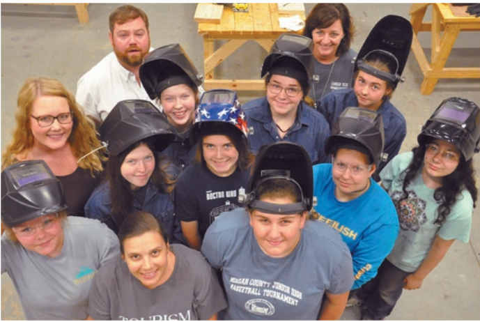
High school girls from across north Alabama took part in Session One of SWeETy (Summer Welding & Electrical Technology) Camp, hosted by Priceville High School.

by Contractor Service and Fabrication Inc. of Decatur, while Session Two was June 10-13, hosted by Calhoun Community College, is presented by Indorama Ventures of Decatur.