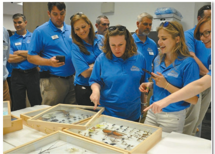
Excellence class members in April received a behind-the-scenes look at the Cook Museum of Natural Science collections area prior to their June opening.