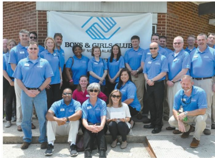
The May class ended the day at the 3rd Street Boys & Girls Club – their community service project recipient – with a tour and a presentation to the club of more than $11,000 raised during the 10-month class for after school programs, tutoring and technology.