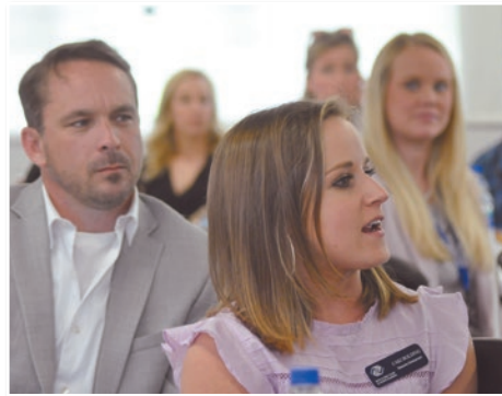
Attendees shared with the three-person panel what they were looking for in housing, specifically upscale multifamily developments and starter homes.