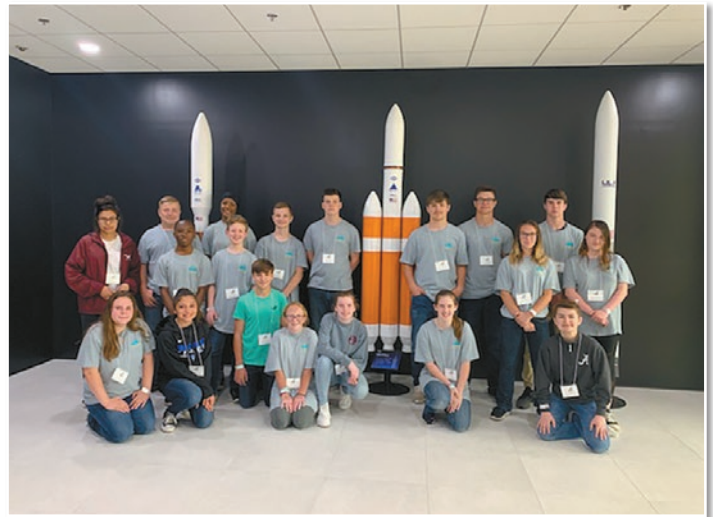
Equip ended April 30 with an extensive tour of the United Launch Alliance assembly facility program in Decatur and discussion with their team about careers in aeronautics and engineering.