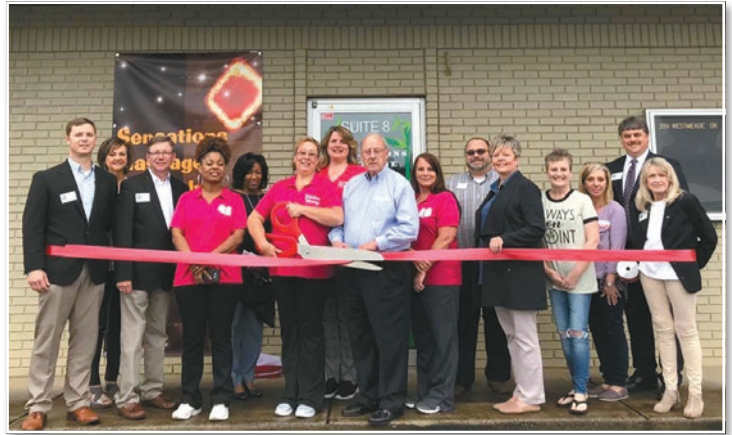
Sensations Massage & Body Clinic 2119 Westmeade Drive SW, Suite 8, Decatur • (256) 822-2215 www.massagebook.com/Decatur-Massage-Sensationsmassageandbodyclinic