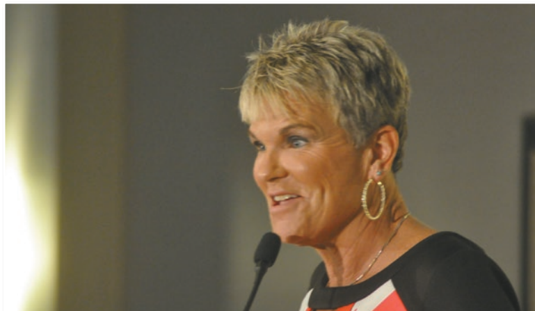
Grumbir opened her non-profit in 2012 with the goal of serving the homeless community in Decatur-Morgan County.