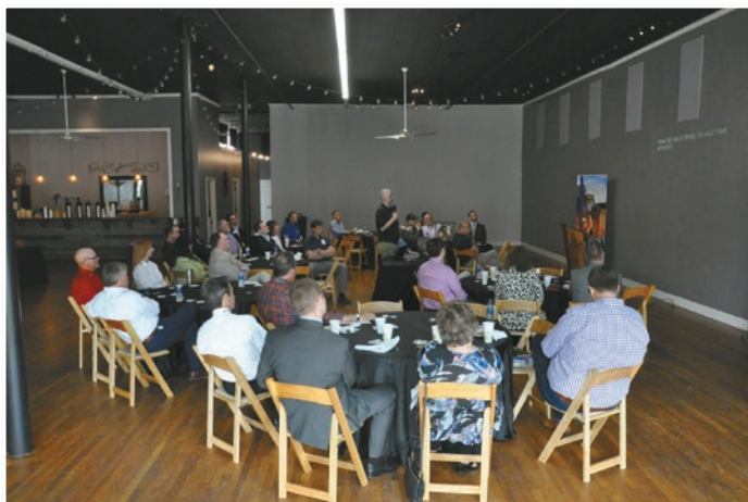
Business and community leaders from across north Alabama gathered at The Magnolia Room in Decatur to discuss the value of digital security for your personal and customer information at the April edition of Breakfast & Biz.