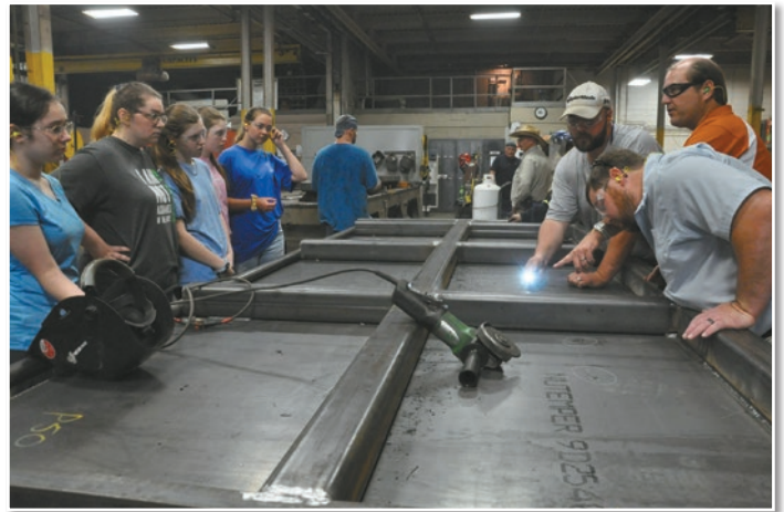
On the final day of the session, students traveled to the Decatur location of CSFCO to visit real-world environments where their recently developed skills are used in an industrial setting.