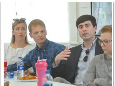
Young professionals from diverse businesses and industries shared their thoughts on the economics of residential development in our area and the challenges we are working to overcome to reach success.