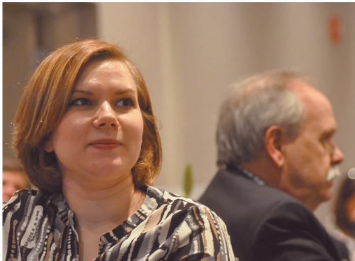
More than 200 people attended the Chamber's annual Small Business Awards Celebration.