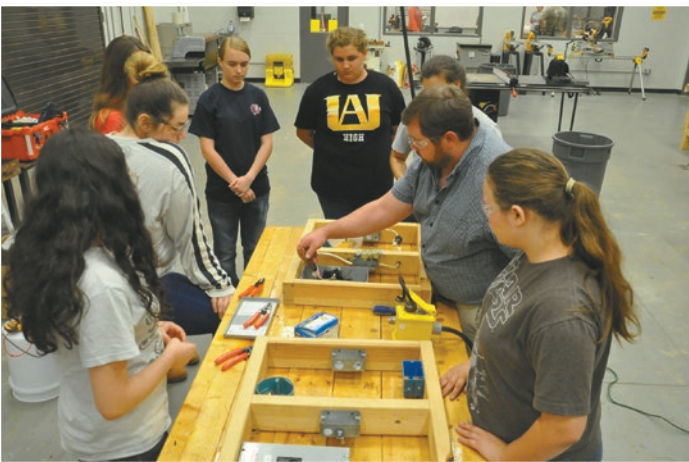
Students received hands-on training from certified instructors during the four-day SWeETy Camp.