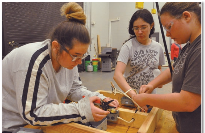
During the week, each student was responsible for completing assigned tasks using the skills they learned during the instruction periods.