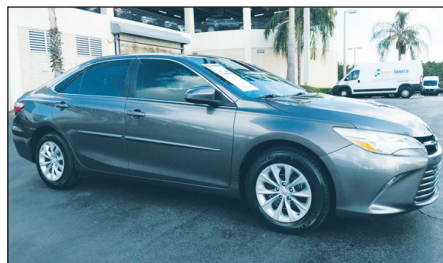
2015 TOYOTA CAMRY LE Stock#T637225A $11,354