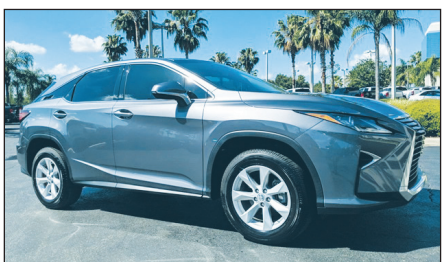
2017 LEXUS RX 350 Stock#I068756 $35,990