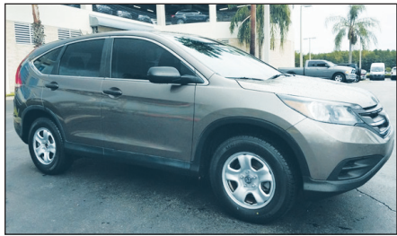
2012 HONDA CR-V LX Stock#H579137A $11,749