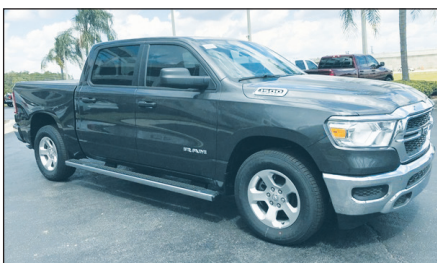
2019 RAM 1500 TRADESMAN Stock#N805946A $31,500