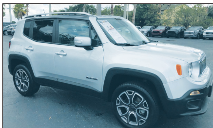
CERTIFIED 2018 JEEP RENEGADE LIMITED Stock#PG72116 $18,887