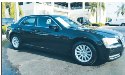
2012 CHRYSLER 300 Stock#H577697N $10,999