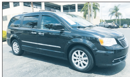
2015 CHRYSLER TOWN & COUNTRY TOURING Stock#R697966 $14,327