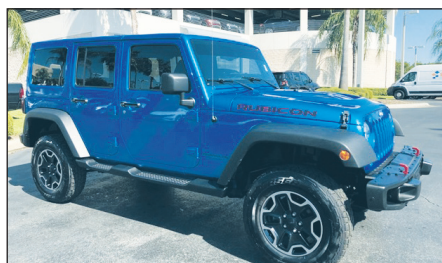
2015 JEEP WRANGLER UNLIMITED RUBICON Stock#L743505 $31,150