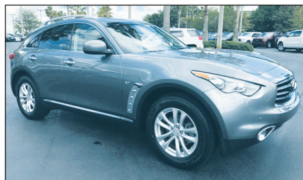
2016 INFINITI QX70 AWD Stock#N750865C $19,600