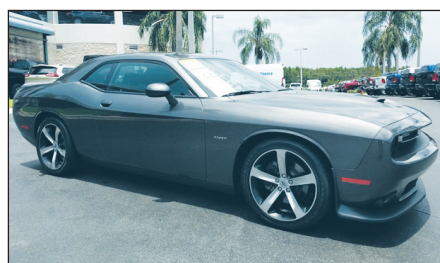
2019 DODGE CHALLENGER R/T Stock#H512118 $28,990