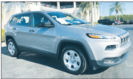
2016 JEEP CHEROKEE SPORT Stock#W216606 $15,389