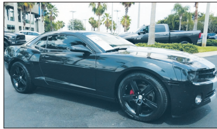
2012 CHEVROLET CAMARO 2LT Stock#9200489 $12,919