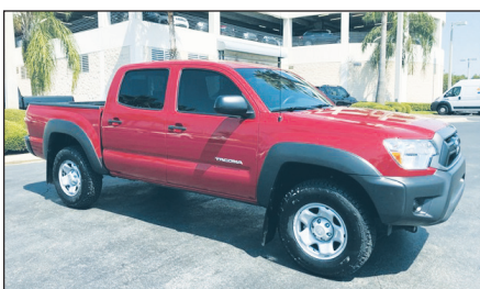
2015 TOYOTA TACOMA PRERUNNER Stock#X050852 $20,888