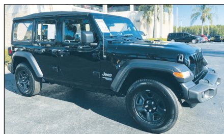
2018 JEEP WRANGLER UNLIMITED SPORT 4WD Stock#W544524A $32,450