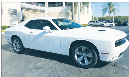
2016 DODGE CHALLENGER SXT Stock#H540460A $17,775