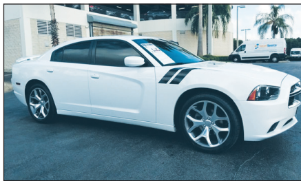
2014 DODGE CHARGER SXT Stock#N730005A $15,500