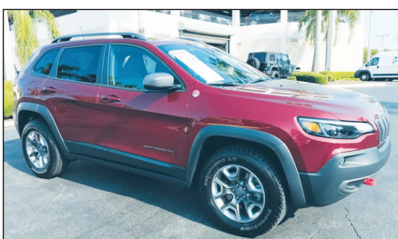
2019 JEEP CHEROKEE TRAILHAWK 4WD Stock#D347148 $26,226