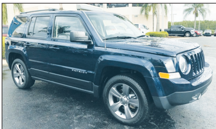
CERTIFIED 2015 JEEP PATRIOT HIGH ALTITUDE Stock#D430359 $13,800