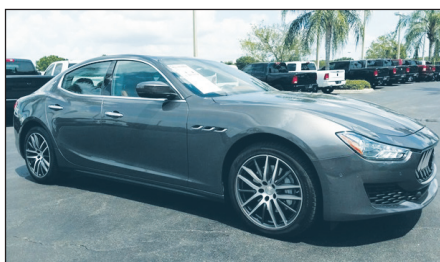
2018 MASERATI GHIBLI Stock#W3301958 $46,222