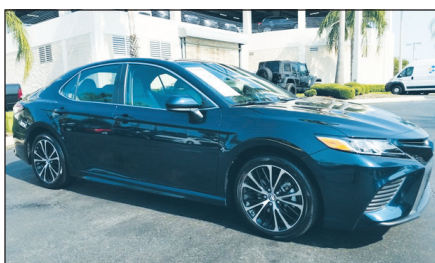
2019 TOYOTA CAMRY SE Stock#O689312 $21,498