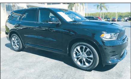
2019 DODGE DURANGO R/T Stock#C598993 $36,594