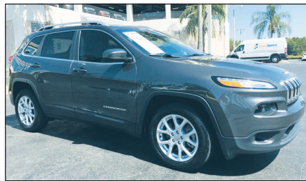
2017 JEEP CHEROKEE LATITUDE Stock#T658202A $16,900