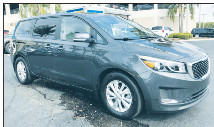
2018 KIA SEDONA LX Stock#S314885A $22,100