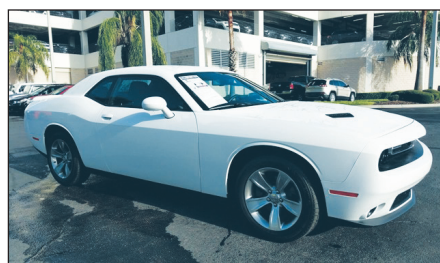
2019 DODGE CHALLENGER SXT Stock#O529083 $21,593