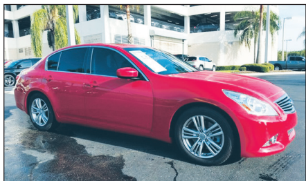
2013 INFINITI G37 JOURNEY Stock#C650961A $13,400