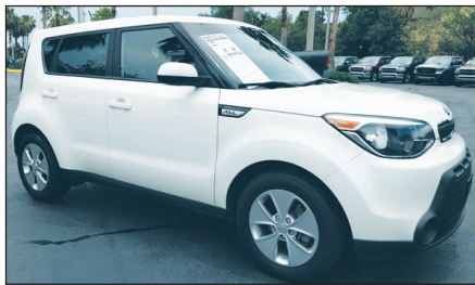
2015 KIA SOUL BASE Stock#T647451C $8,427