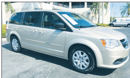
2015 DODGE GRAND CARAVAN SE Stock#I330363A $13,899