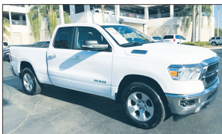
2019 RAM 1500 BIG HORN LONE STAR Stock#O656466 $31,999