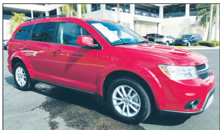
2017 DODGE JOURNEY SXT Stock#T643535 $17,105