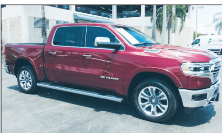
2019 RAM 1500 LARAMIE LONGHORN Stock#N750862A $44,000