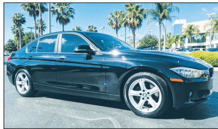
2013 BMW 3 SERIES 328i Stock#D370577A $9,000