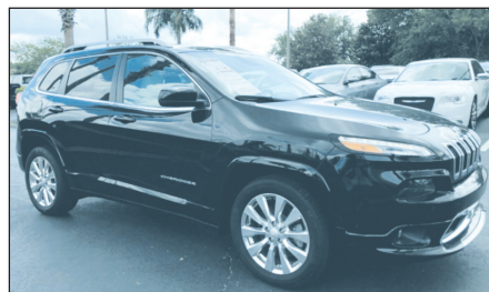
CERTIFIED 2018 JEEP CHEROKEE OVERLAND Stock#D563281 $24,900