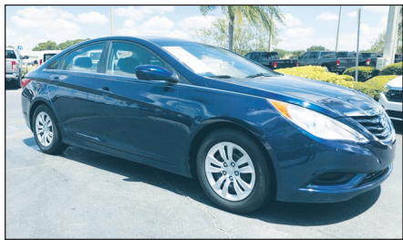
2011 HYUNDAI SONATA GLS Stock#R570238B $7,000