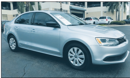
2013 VOLKSWAGEN JETTA S Stock#S559990B $7,299