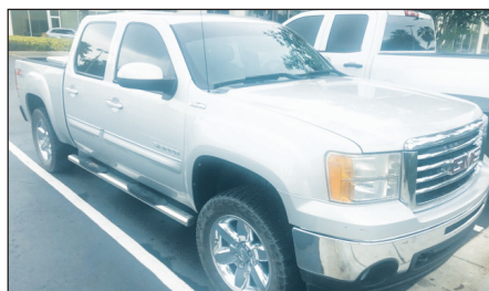
2011 GMC SIERRA 1500 SLT Stock#Z190500A $19,789