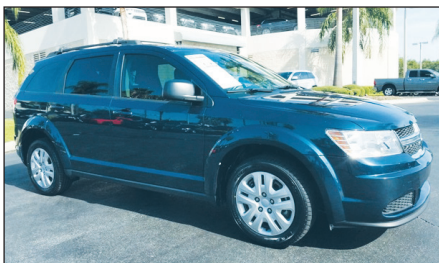
2015 DODGE JOURNEY AVP Stock#G553042B $10,989