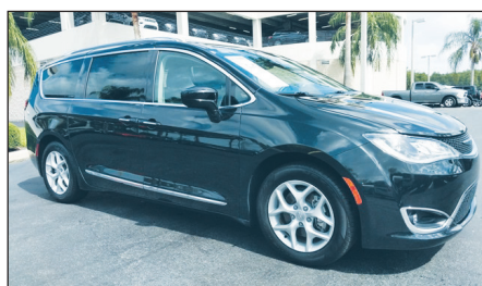
2018 CHRYSLER PACIFICA TOURING L Stock#R193193 $25,990