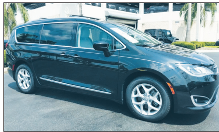
2017 CHRYSLER PACIFICA TOURING L PLUS Stock#R570237A $22,300