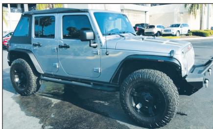
2015 JEEP WRANGLER UNLIMITED SPORT 4WD Stock#W511300B $24,887