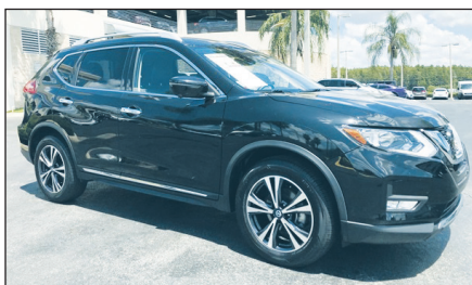
2018 NISSAN ROGUE SL Stock#O463187 $20,400