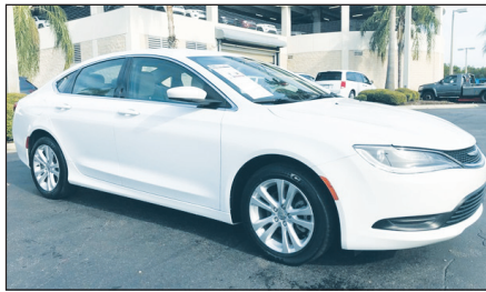
2016 CHRYSLER 200 LX Stock#N181926 $12,500