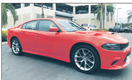
2019 DODGE CHARGER GT Stock#H553692 $26,424