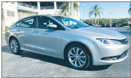
2016 CHRYSLER 200 S Stock#N100253 $14,974