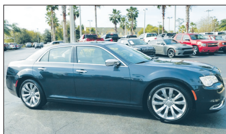
2018 CHRYSLER 300 LIMITED Stock#H296057 $20,700