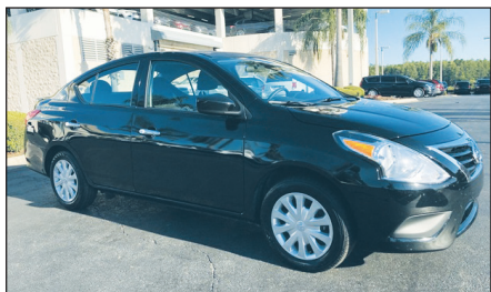
2018 NISSAN VERSA SV Stock#L807443 $9,750