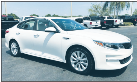
2016 KIA OPTIMA LX Stock#T646416B $12,105