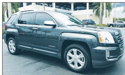
2017 GMC TERRAIN SLT Stock#L936031A $20,684