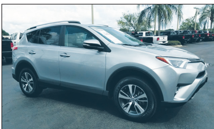
2018 TOYOTA RAV4 XLE Stock#O469298 $20,299