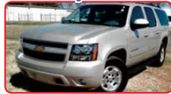
2013 Chevy Suburban LT