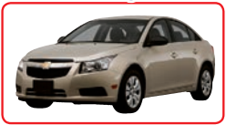
2012 Chevy Cruze