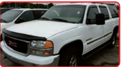
2001 GMC Yukon XL