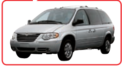
2006 Chrysler Town & Country