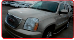
2007 GMC Yukon Denali