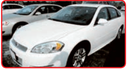
2014 Chevy Impala