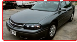
2004 Chevy Impala

63,000 miles, Local Trade-in, Very Well Kept!! #6420-A