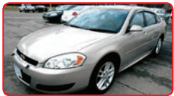
2012 Chevy Impala LTZ