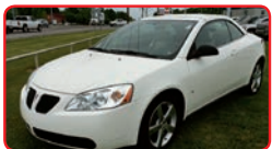
2007 Pontiac G6

Convertible, 1 Owner, 43,000 Miles, Garage Kept. #115170-A