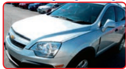
2013 Chevy Captiva Sport