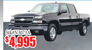
01 Chevy Silverado 1500