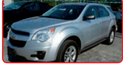
2014 Chevy Equinox