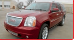
2008 GMC Yukon XL Denali