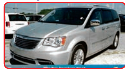
2012 Chrysler Town & Country