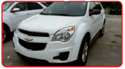
2013 Chevy Equinox