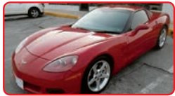
2005 Chevy Corvette