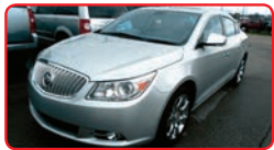
2011 Buick Lacross CXS