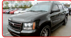
2013 Chevy Avalanche

Black Diamond, Chrome Wheels, Loaded #115174A