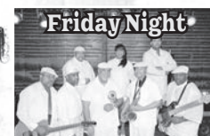
Featuring The Entice Band