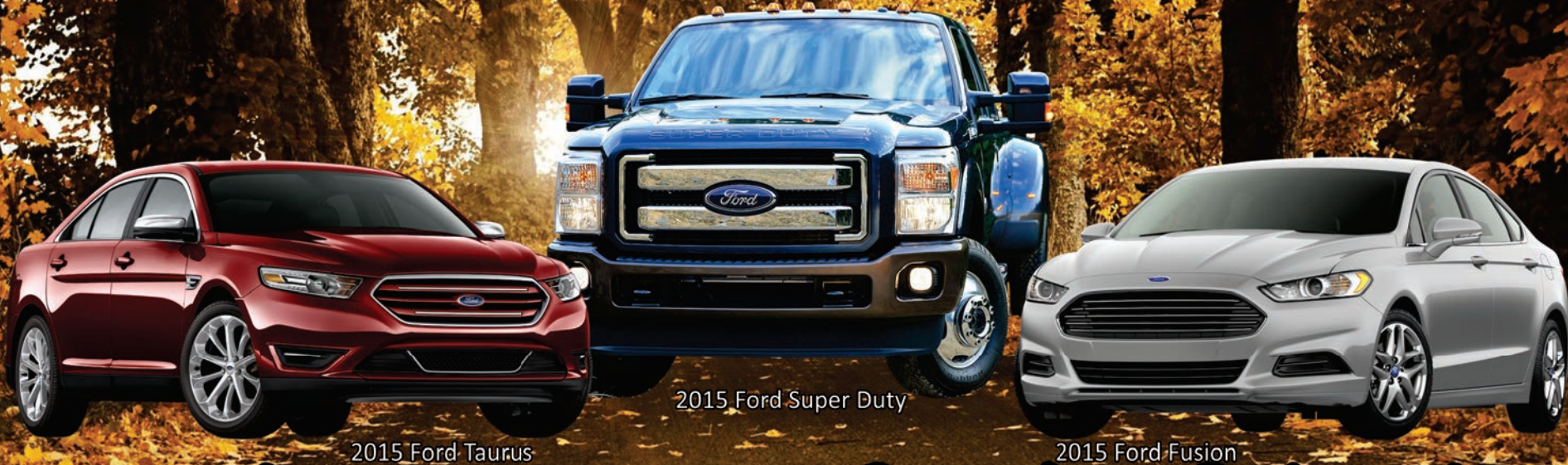
2015 Ford Taurus