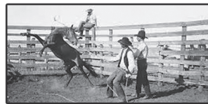
Primitive methods in ranch horsebreaking