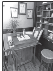
Matador formal dining room Matador registry desk