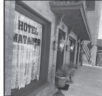
Matador Hotel has lovely outdoor seating and dining

retains the original tin ceiling and elaborate bathroom fixtures. If you stop in at the Matador Hotel, whether you plan to book a stay or just want to view the luxury from a time past, you will receive a warm welcome and a friendly lesson on it's history.