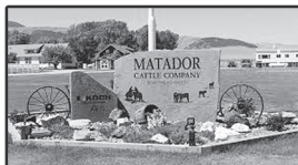
Today's Matador Ranch entrance