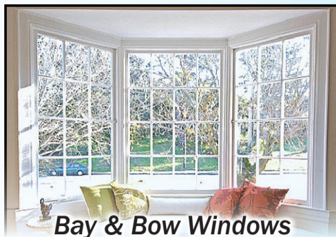
Bay & Bow Windows

That's Why Over 39,000 Homeowners Have Chosen Paramount