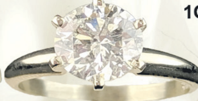
14K Diamond Solitaire

1CT 1/2CT Reg $5,000.00 Reg $2,500.00 Sale $2195 Sale $1195