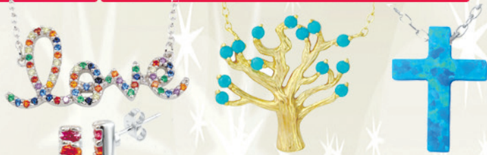
Largest Silver Collection Ever