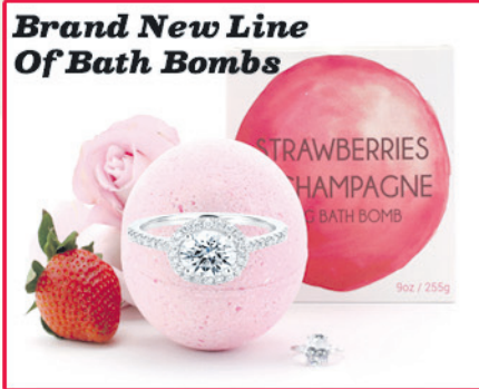
Brand New Line Of Bath Bombs