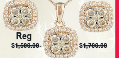
Chocolate Diamond Earrings & Necklace