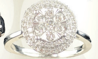
1/2CT Diamond Ring