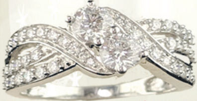
1CT 14KW U & Me Ring

Best Selection, Lowest Prices In The TN Valley