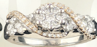
1CT 14KRW Diamond Ring

1CT 1/2CT Reg $5,000.00 Reg $2,500.00 Sale $2195 Sale $1195