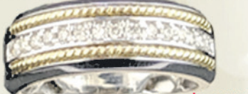
3/8CT Mens Diamond Band