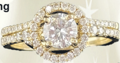
1.15CT 14KY Engagement Set