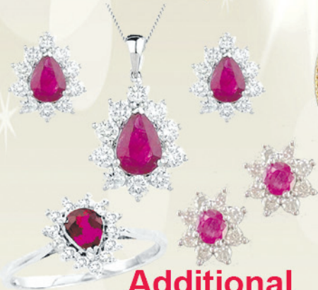
Ruby July Birthstone