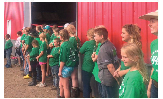
The Young Riders are excited about the new barn.

our Young Riders Club, of which about 50 have their own horses and others use a friend's or relative's horse,"