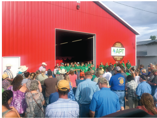
A crowd gathers in front of the bright red horse barn for its dedication at the Aitkin County Fairgrounds.