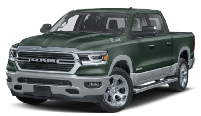
MSRP $50,280 Stock #19-0409

*36 mo., 10,000 miles a year, $2,999 Down, Tax, Title, License & 1st Payment Extra. All Rebates to Dealer.