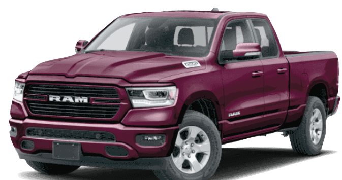
Stock #19-0773 MSRP $46,515

*36 mo., 10,000 miles a year, $2,999 Down, Tax, Title, License & 1st Payment Extra. All Rebates to Dealer.