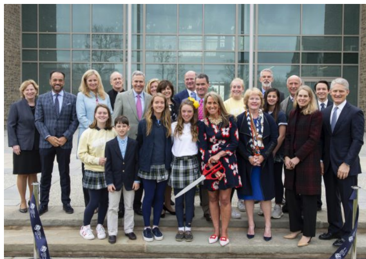
The Academy of Notre Dame de Namur's new Riley Center for STEM Education includes state-of-the-art laboratories and space dedicated to robotics, design and innovation.