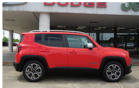
16 Jeep Renegade Limited #T8J048A.....$15,499