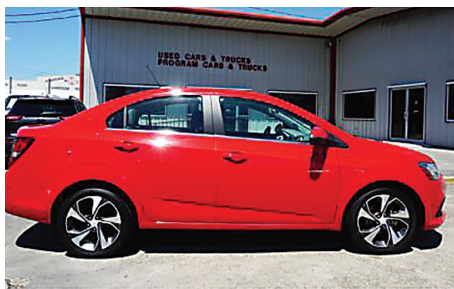
17 Chevrolet Sonic Premier #8J0289A.....$11,997