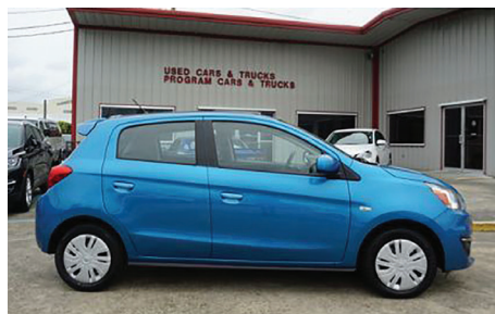
17 Mitsubishi Mirage ES #11121.....$8,997