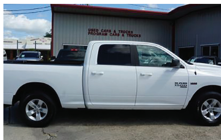
19 RAM 1500 Classic SLT #11155.....$31,997