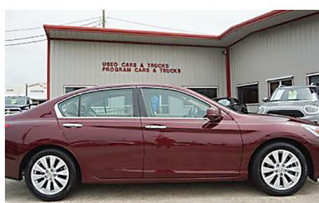
15 Honda Accord EX-L #9T0156A.....$16,997