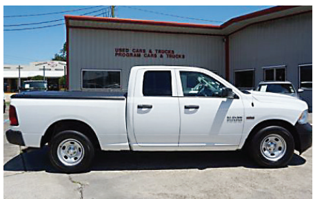
15 RAM 1500 Tradesman #9T0064A.....$17,997