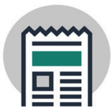
Local News Advertising

Adtaxi is a client-centric organization that brings scale, precision, and sophistication to digital marketing. Leveraging the belief that people matter as much as technology, we help advertisers solve complex marketing challenges with custom, performance-driven solutions.