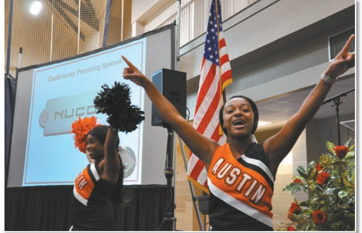
Austin High School cheerleaders helped introduce new staff members at the Decatur City New Teacher Breakfast.