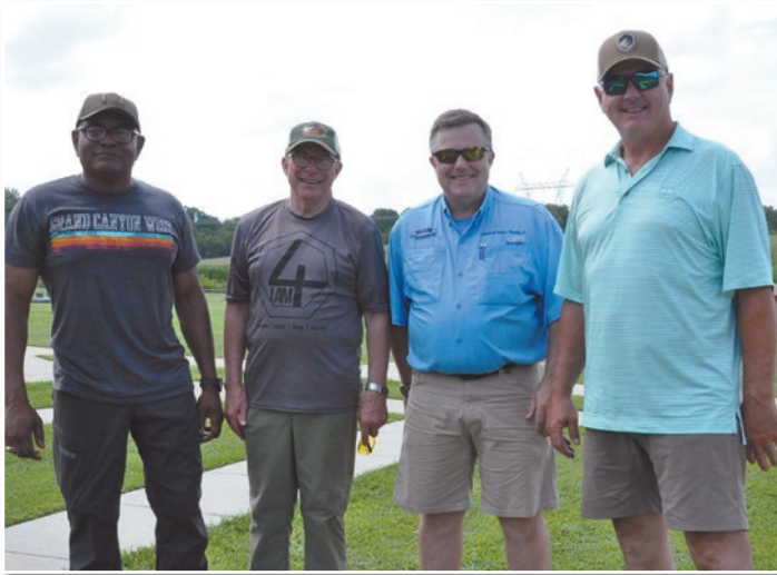
In the afternoon flight, Guice Pharmacy won the grouping with a score of 312.