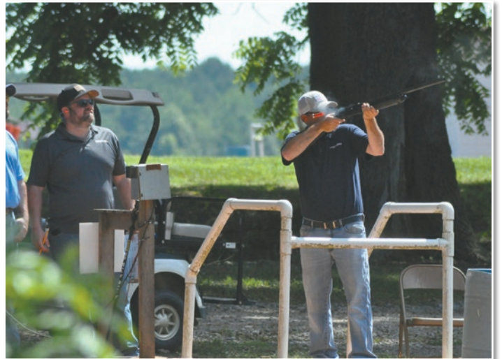
More than 65 shooters enjoyed an afternoon away from the office during the Chamber's annual Clay Shoot Classic.