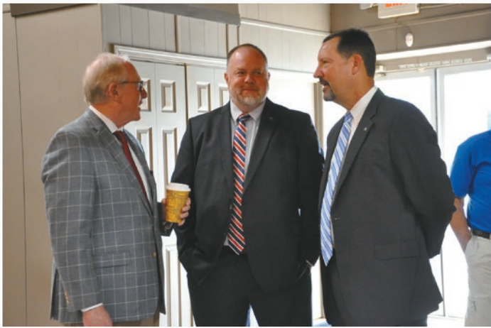
Business and community leaders from across Morgan County attended the Chamber's annual State of the State Forum.