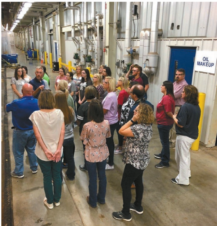
Hexcel served as an industry host during the Chamber's annual Teachers on Tour event.