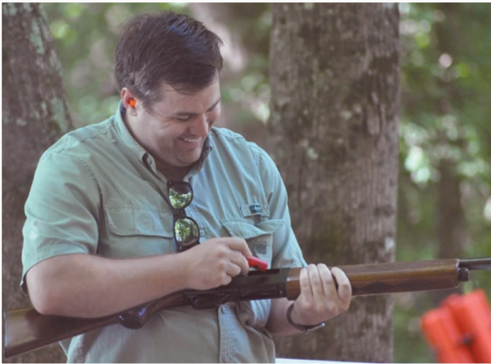
Events like the Chamber's annual Clay Shoot Classic are opportunities for members to network with clients and customers outside of your traditional networking environments.