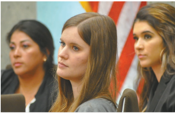
Young professionals from across north Alabama attended the Chamber’s July YP Leadership Luncheon.