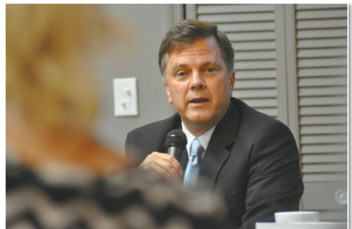
Sen. Arthur Orr of Decatur spoke briefly during the Chamber's State of the State Forum.