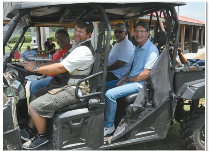
Shooters from across north Alabama turned out for the Chamber's annual Clay Shoot Classic at Limestone Hunting Preserve.