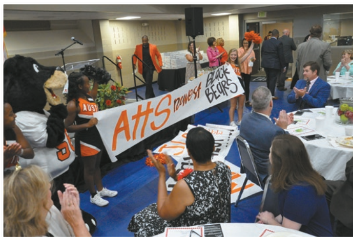
Austin High School cheerleaders helped introduce new staff members at the Decatur City New Teacher Breakfast.