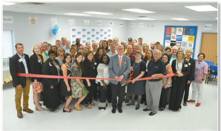
The United Way of Morgan County 115 1st Avenue NE, Decatur • (256) 353-6643 www.uwmc.org