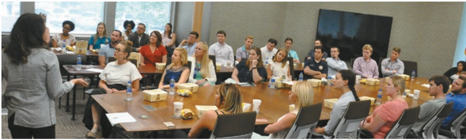
More than 40 young professionals took part in the Chamber’s July gathering of the YP Leadership Luncheon series.

visitors to our area, but it is a huge economic driver, providing jobs and tax revenue in our own back yard. The YP Leadership Luncheon series is presented by Ascend Performance Materials , along with July lunch sponsor Fite Building Company .