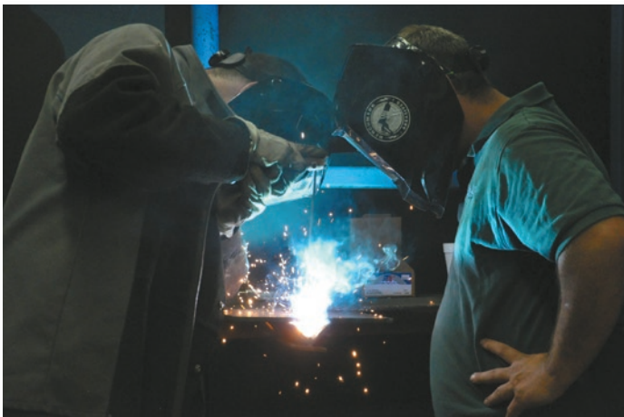
During the week, students were taught by certified welding instructors and learned the required skills to work in the industry.

The week was also made possible by lunch sponsors J.M. Smucker Company , Java Jaay Café and Kinder MorganBulk Terminals .