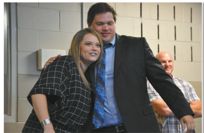
Principals at the Chamber's annual New Teacher Breakfast events each do a "roll call" of their new staff members and introduce them to the group.