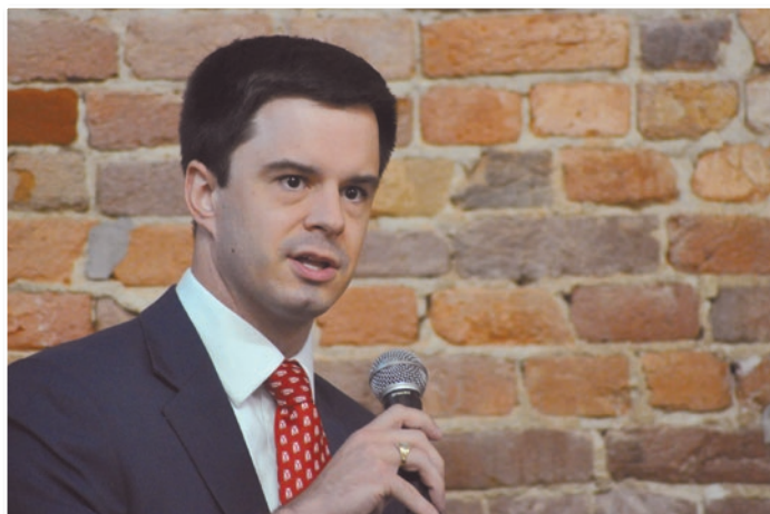
Rep. Parker Moore of Decatur spoke briefly during the Chamber's State of the State Forum.