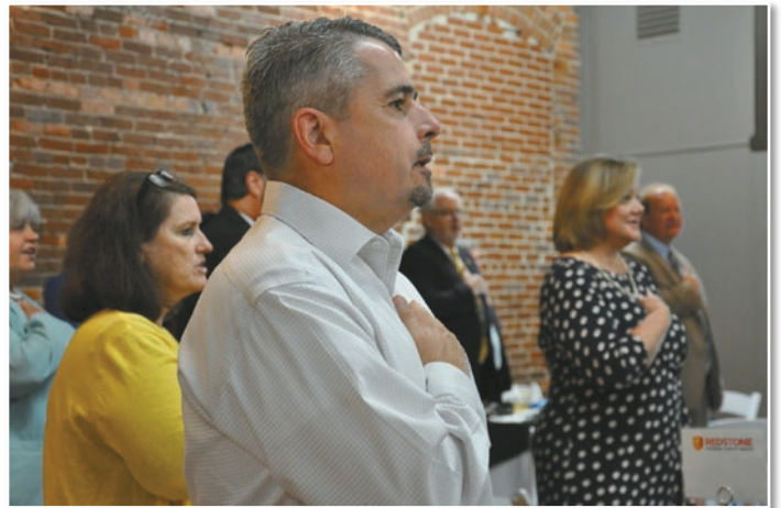
The Chamber's annual State of the State Forum is an opportunity for the Morgan County Delegation and the business community to connect and discuss policies impacting our area's quality of life.