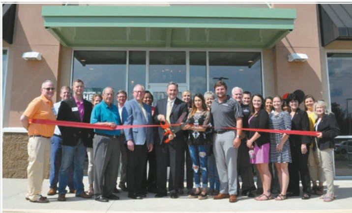
Healthsource of Decatur 2934 Point Mallard Parkway SE, #B2, Decatur • (256) 584-9554 www.healthsourcechiro.com/decatur-se/