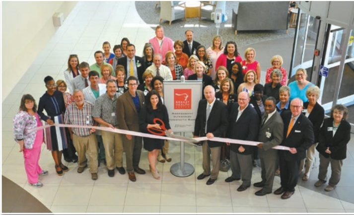
The Breast Health Center at Decatur Morgan Hospital 1201 7th Street SE, Decatur • (256) 973-2000 www.decaturmorganhospital.net