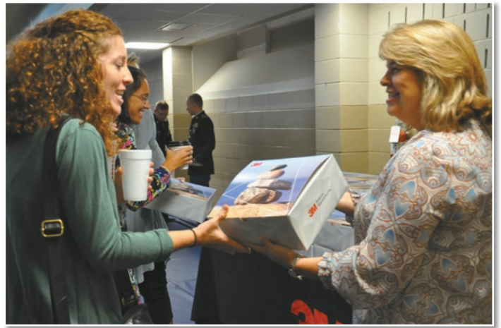
Each new teacher at both events received a box of school supplies for their classrooms, courtesy of gold sponsor 3M of Decatur.