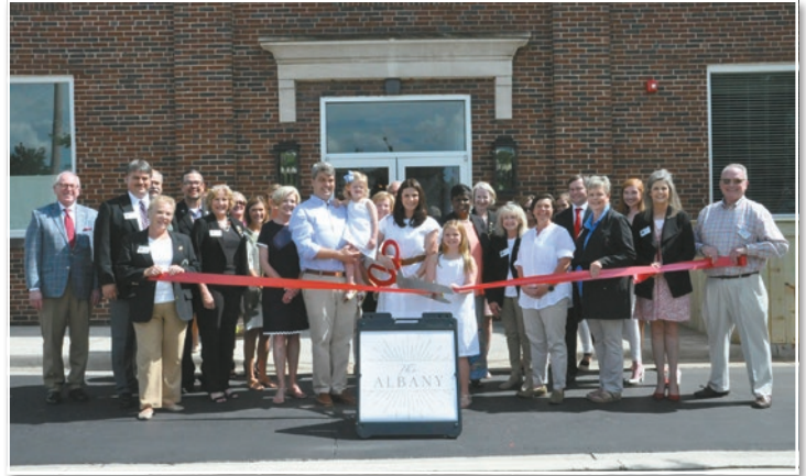
The Albany 400 Grant Street, Unit 1-A, Decatur • (256) 654-0811 www.the-albany.com