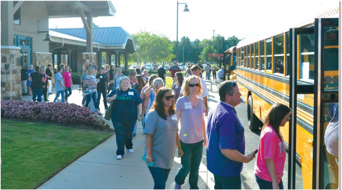
New teachers from across Morgan County loaded up on buses to take part in the Chamber's annual Teachers on Tour event.