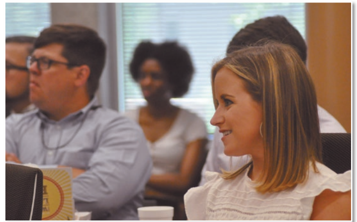
Young professionals from across north Alabama attended the Chamber’s July YP Leadership Luncheon.