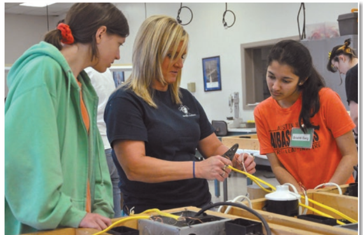
In the electrical classroom, students received hands-on training in wiring, circuitry and current flow, and learned how to safely hone their skills.