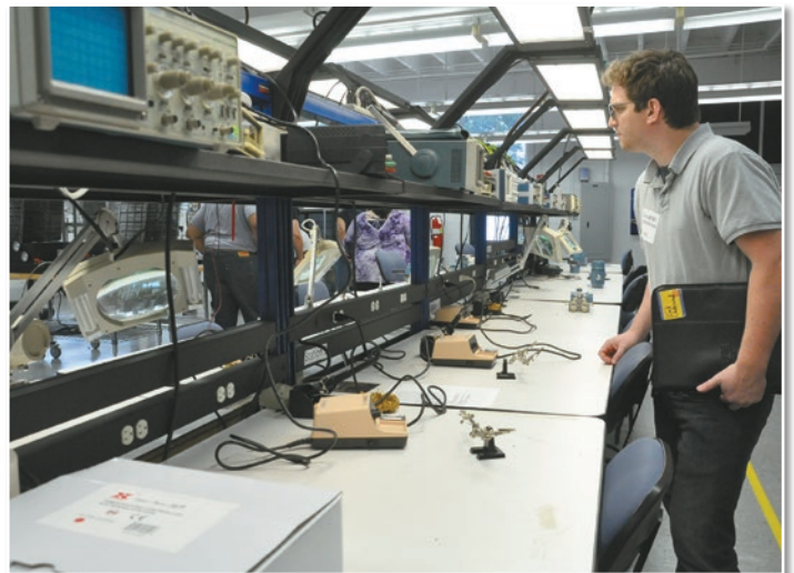
New teachers from across Morgan County toured the advanced manufacturing and innovation lab at Calhoun Community College as part of the Chamber's annual Teachers on Tour event.