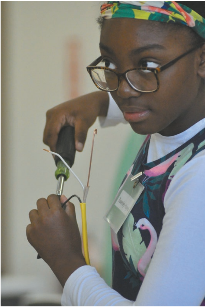
High school girls from across north Alabama took part in the annual SWEeTy Camp.