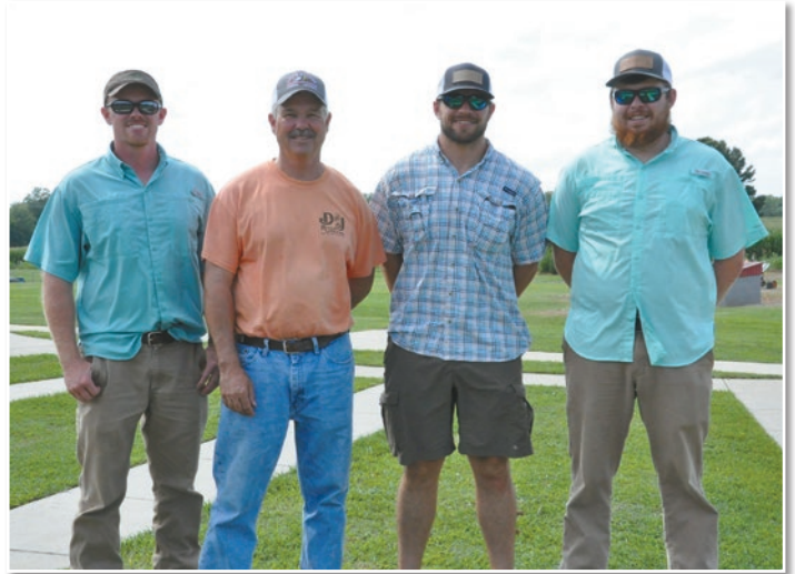
Coming in second in the afternoon flight was the team from Alabama Farmers Co-Op with a score of 273.