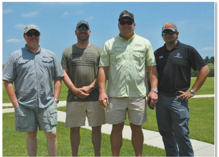
The team from Gateway Commercial Brokerage placed second in the morning flight with a score of 315.