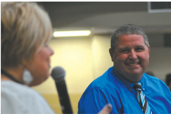
Principals at the Chamber's annual New Teacher Breakfast events each do a “roll call” of their new staff members and introduce them to the group.

Credit Union , the all-day event featured area employers showcasing the work they do and what types of opportunities are available for graduates right in their own backyard. Visited industries included Indorama Ventures, Hexcel Corporation, 3M of Decatur, and education partner the Decatur campus of Calhoun Community College. The more than 160 involved enjoyed lunch and time to network with their peers across systems. The goal of the event is to equip teachers with the knowledge and information to help steer their students towards a successful future and develop a strong future workforce. The Chamber and partner Morgan County Economic Development Association are thankful for silver sponsor Indorama Ventures , and corporate sponsors Ascend Performance Materials and Hexcel for helping make the day possible and supporting the shared mission of strengthening our workforce.