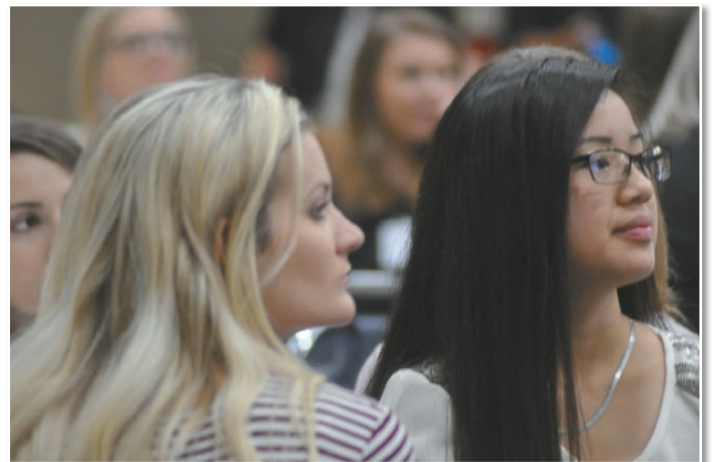
More than 130 attended the Chamber's annual Morgan County Schools New Teacher Breakfast.