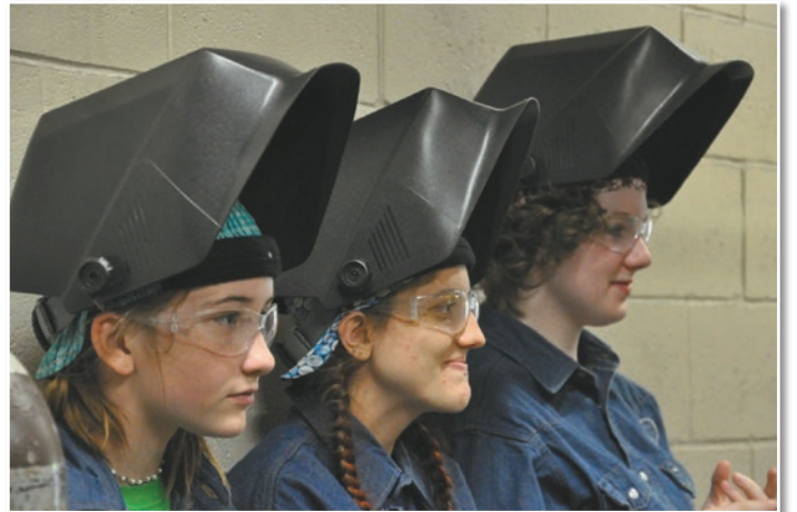
Exposure to non-traditional fields for women to students provides them the opportunity to explore previously undiscovered interests that can provide a rewarding career.