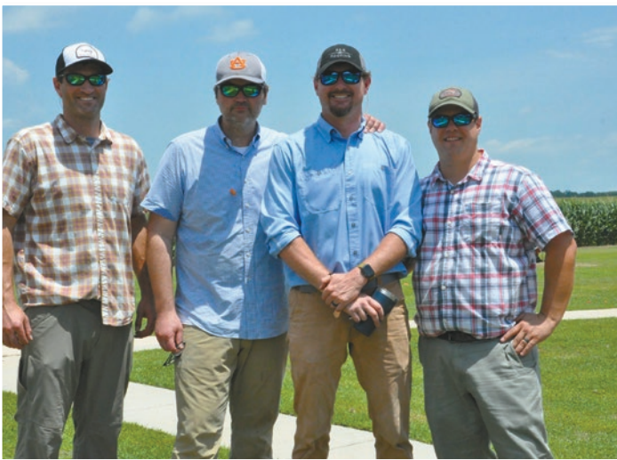
The team from Progress Bank won the morning flight for a score of 318.