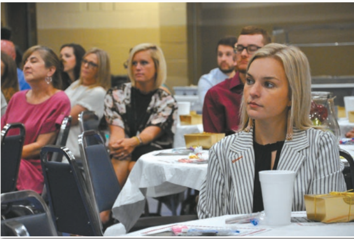
More than 130 attended the Chamber's annual Morgan County Schools New Teacher Breakfast.