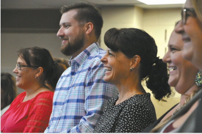
Principals at the Chamber's annual New Teacher Breakfast events each do a "roll call" of their new staff members and introduce them to the group.