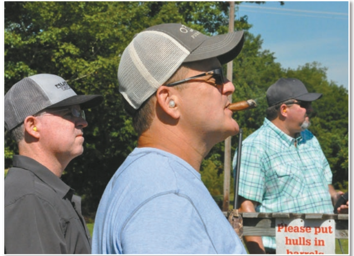
Shooters from across north Alabama turned out for the Chamber's annual Clay Shoot Classic at Limestone Hunting Preserve.