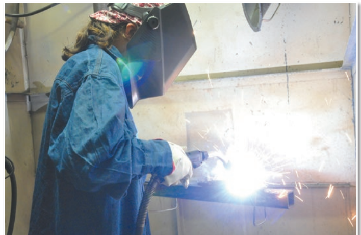
Class members learned first-hand the skills and knowledge required to work in the welding field.