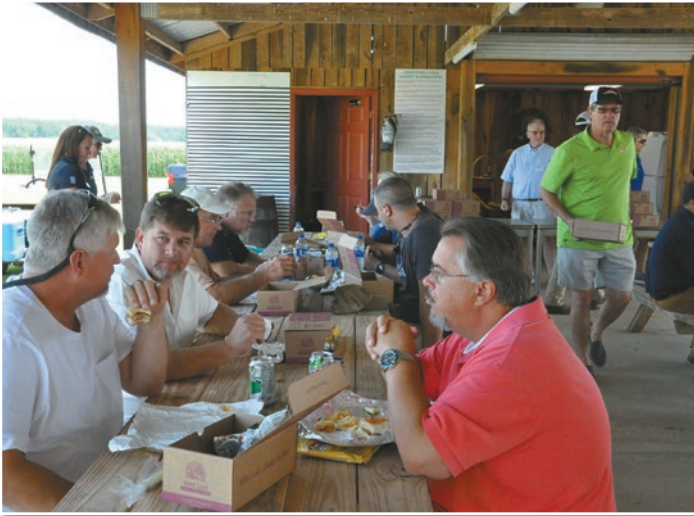
The day was broken up by lunch between the morning and afternoon flights.