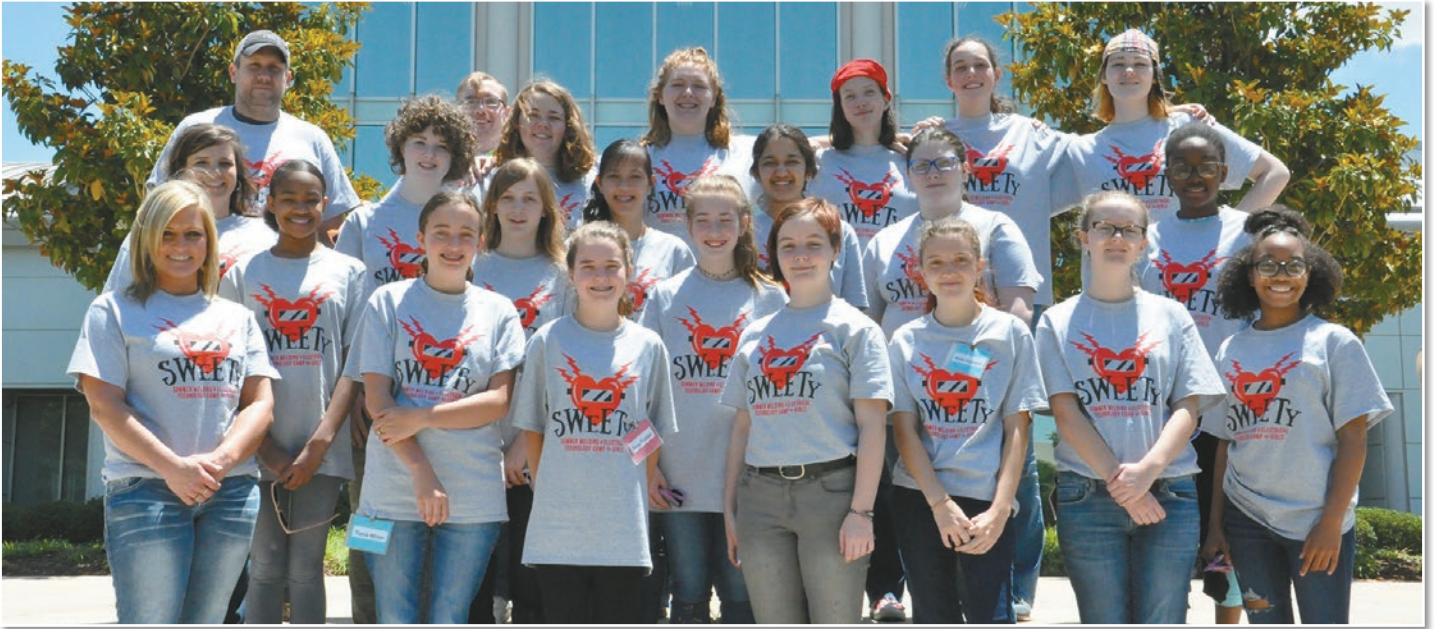
In the 13 years of SWEeTy Camp, the program has graduated more than 360 students.