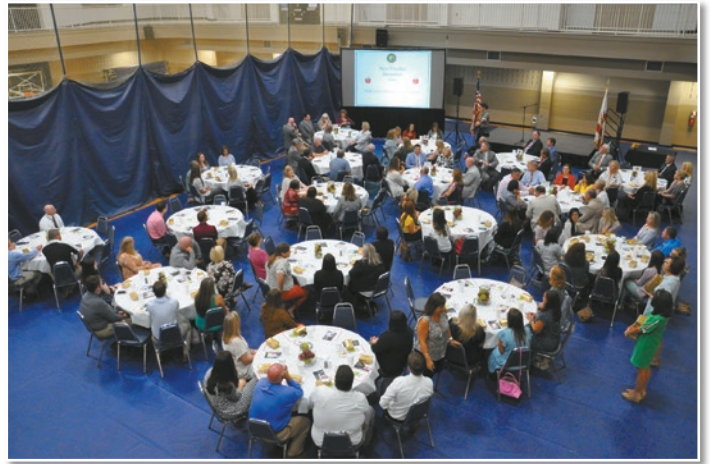
More than 130 attended the Chamber's annual Morgan County Schools New Teacher Breakfast.