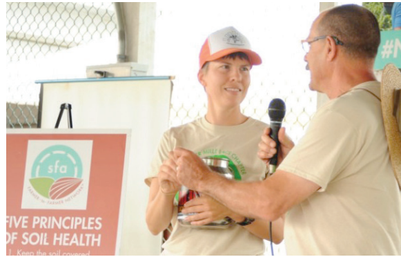
Five Principles of Soil Health

Every year, the local Greater Mille Lacs chapter of the Sustainable Farming Association invites the community to come join them for the Farm2Families Festival. Community members can enjoy a dinner produced by Aitkin area farmers, live music, a farmers' market, family activities and much more from 3 to 7 p.m. on Saturday, Aug. 17, at Aitkin County Fairgrounds.