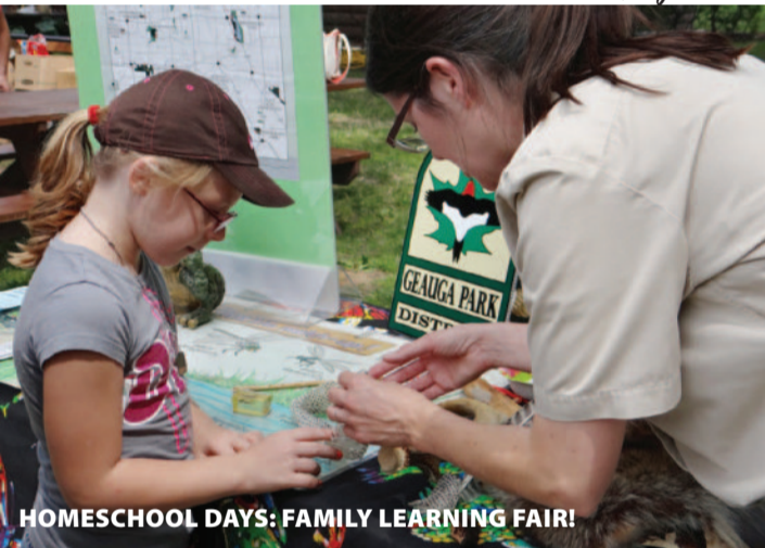
HOMESCHOOL DAYS: FAMILY LEARNING FAIR!