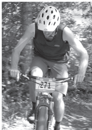
friends and families stayed in the area the entire weekend.