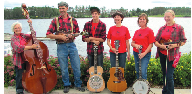
The Sloughgrass Family Band are sure to get the crowd off their seats with their music beginning at 6 p.m.

Tickets for the fashion show and luncheon are available for $16 per person and can be ordered by calling 218-678-4673 or online at www.ruttgers.com/fall-fashion-show-2