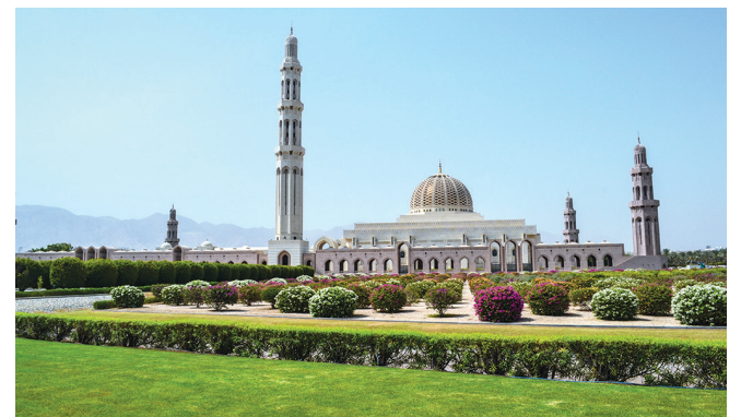
Sultan Qaboos Grand Mosque, Muscat, Oman: the largest and most ornate mosque in all of Oman. It can hold up to 7,000 prayers at once.