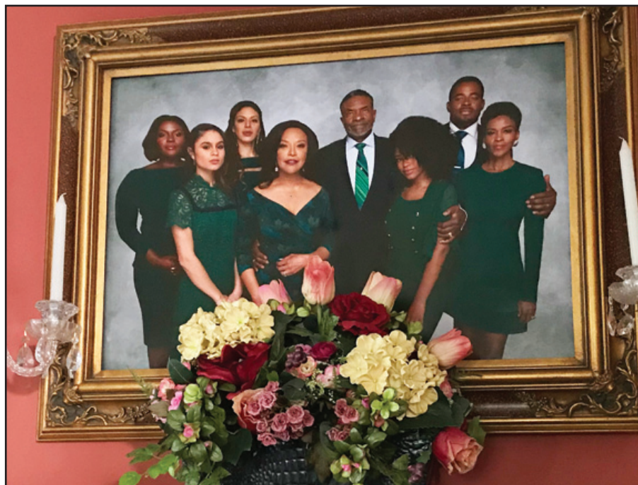
Greenleaf takes viewers into the unscrupulous world of the Greenleaf family and their sprawling Memphis megachurch.

“Lady Mae is glamorous,” said Whitfield, whose many film credits include The Josephine Baker Story. “She is a Lady McBeth. She is a grand lady, but also a hard worker. As we open Season