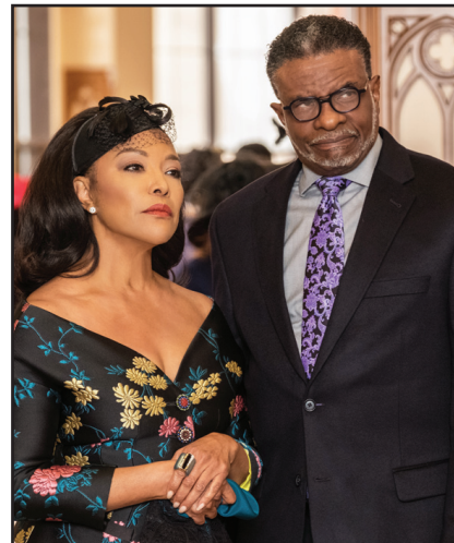
“Lady Mae Greenleaf” (Lynn Whitfield) and “Bishop James Greenleaf” (Keith David).

“In Season Four, this family is fighting to strategize to save Calvary,” said Whitfield. “This is also a family realizing a certain kind of humbleness in how things have gone down. Not only has Calvary been taken over by another church, but it has been taken over by white leadership.”