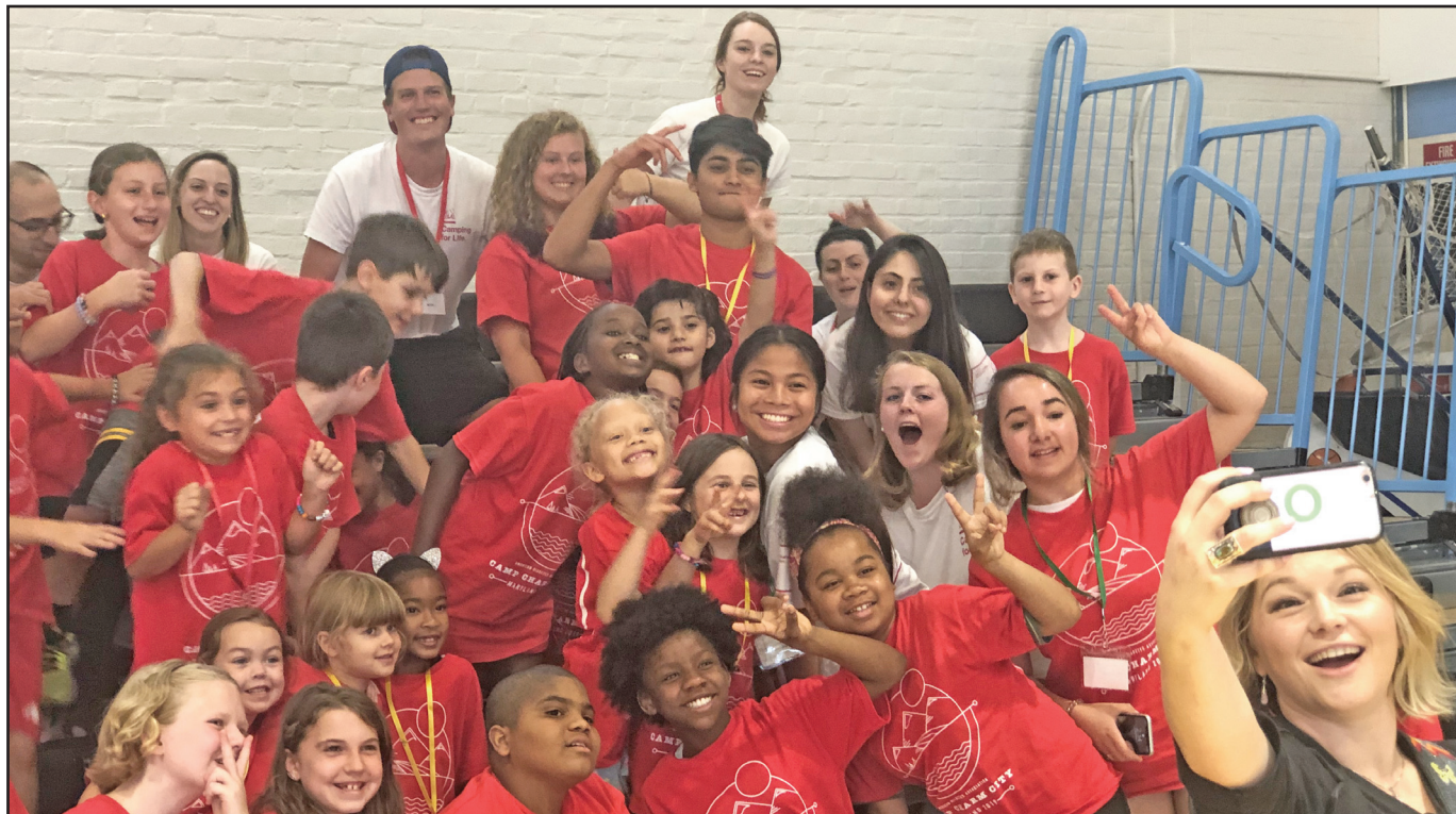
American Idol Season 9 finalist Crystal Bowersox visited “Camp Charm City,” at the Johns Hopkins University Athletic Center in Baltimore where, among other things, she participated in a “Camp Idol” talent show to showcase the various musical talents of the campers. Bowersox was diagnosed with Type 1 diabetes when she was six-years-old. (Above) Crystal Bowersox (right with camera) takes a selfie with campers and counselors at Camp Charm City.

“It was scary when I was diagnosed. I remember hiding under the hospital bed because I didn’t want to take the shots,” Bowersox said. “I didn’t understand at