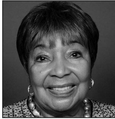
U.S. Congresswoman Eddie Bernice Johnson (D-TX)

Congresswoman Johnson represents the 30th congressional district of Texas in the US House of Representatives.