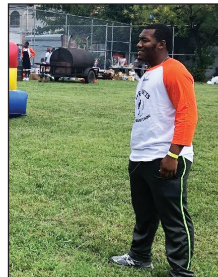
Tumani, Safe Streets

DJ, another YAP participant, led a question and answer session during the Safe Streets grand opening. "Before I was with the YAP program, I used to do any and everything from disrespecting women to disrespecting family and