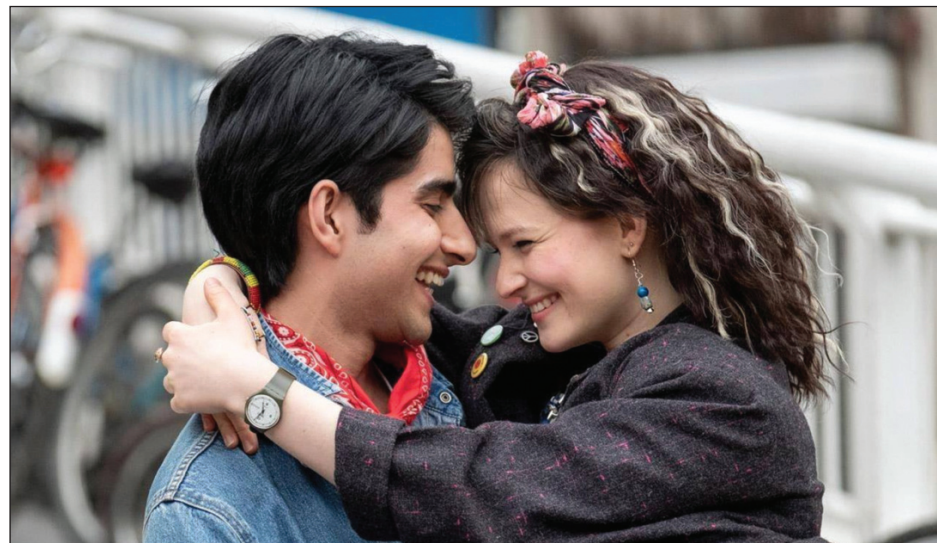
"Blinded by the Light"

For more information www.sjvrc.org or sjvrc16@gmail.com