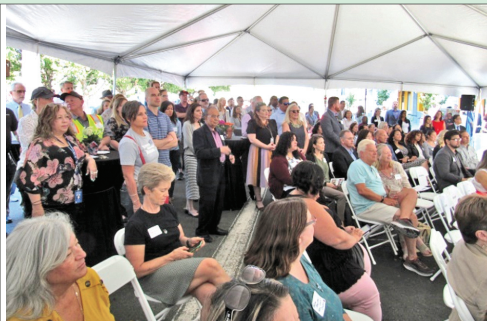
The Second Street Studios affordable housing project grand opening attracted a large crowd.