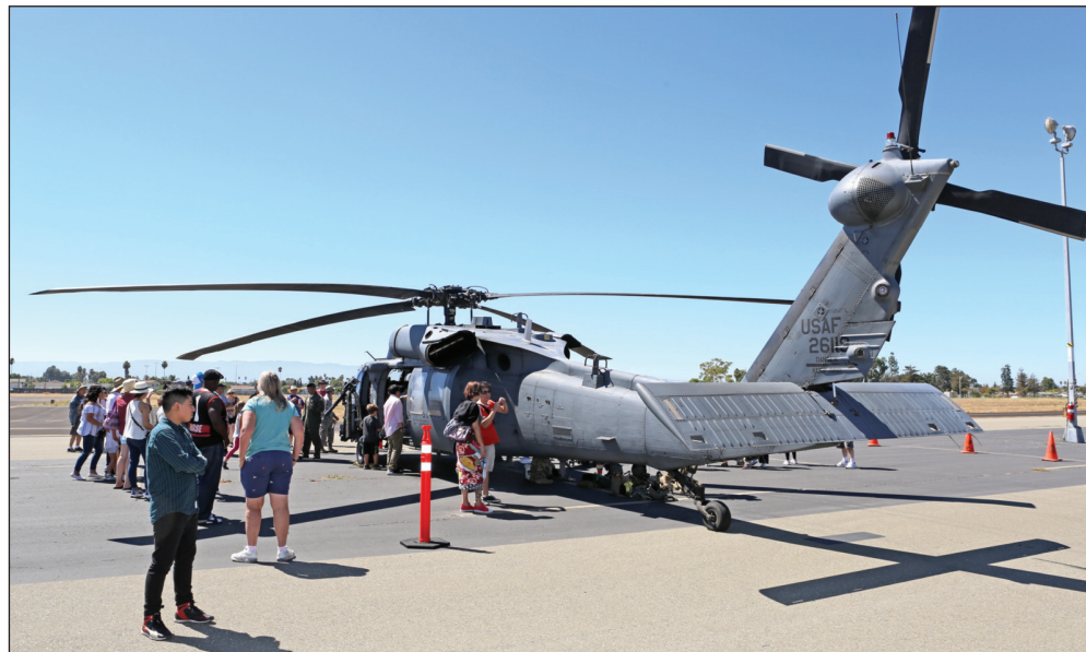
A Blackhawk helicopter from the Air National Guard.