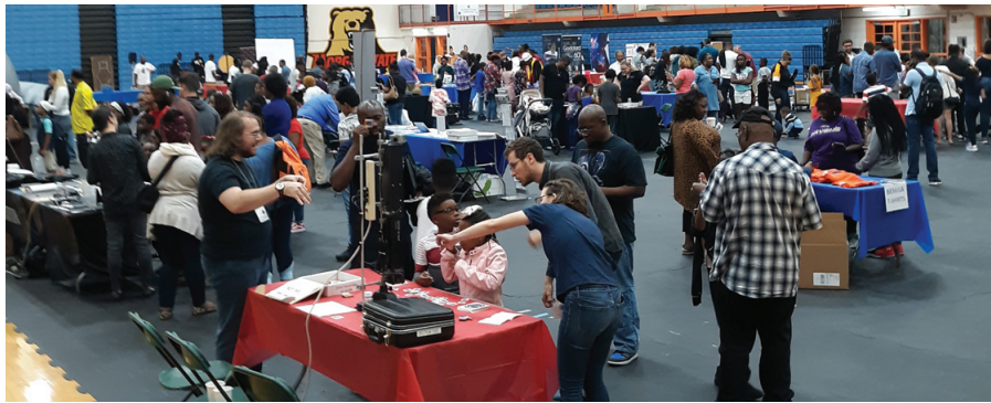
This year's STEM Day Extravaganza at Morgan State University garnered hundreds of students from Baltimore and surrounding areas for a day of fun-filled, interactive, STEM-related educational activities.

So we continue to get this type of program going so that we can get [students] excited and motivate them to think of STEM and remove the fear of doing STEM."