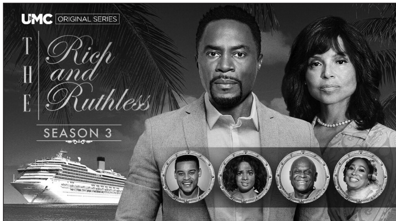
Victoria Rowell's Daytime Emmy nominated soap opera comedy series, "The Rich and the Ruthless," has returned for a third season on the Urban Movie Channel. Rowell (right) who portrays "Kitty Barringer" is pictured with actor Richard Brooks (left) who portrays her husband "Augustus Barringer" on the show.