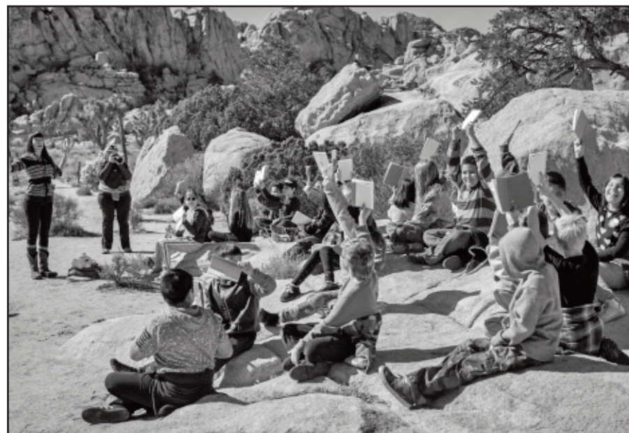
The “Every Kid Outdoors” program provides fourth grade students with free entrance to public lands. Secretary Bernhardt announced $170.6 million to support state parks and outdoor recreation through the Land and Water Conservation Fund. (Above) A group of elementary school children at Joshua Tree National Park in Southern California.

The great outdoors make a great classroom. Fourth grade educators are encouraged to take advantage of the wide range of educational programs and tools associated with the Every Kid Outdoors Program. Educational activities, field trip options, information and tools in