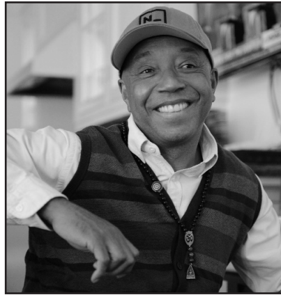
Russell Simmons Courtesy Photo/NNPA

I promise to donate more and support more than I have in the past. The time is now what will you do? With great love, all things are possible.