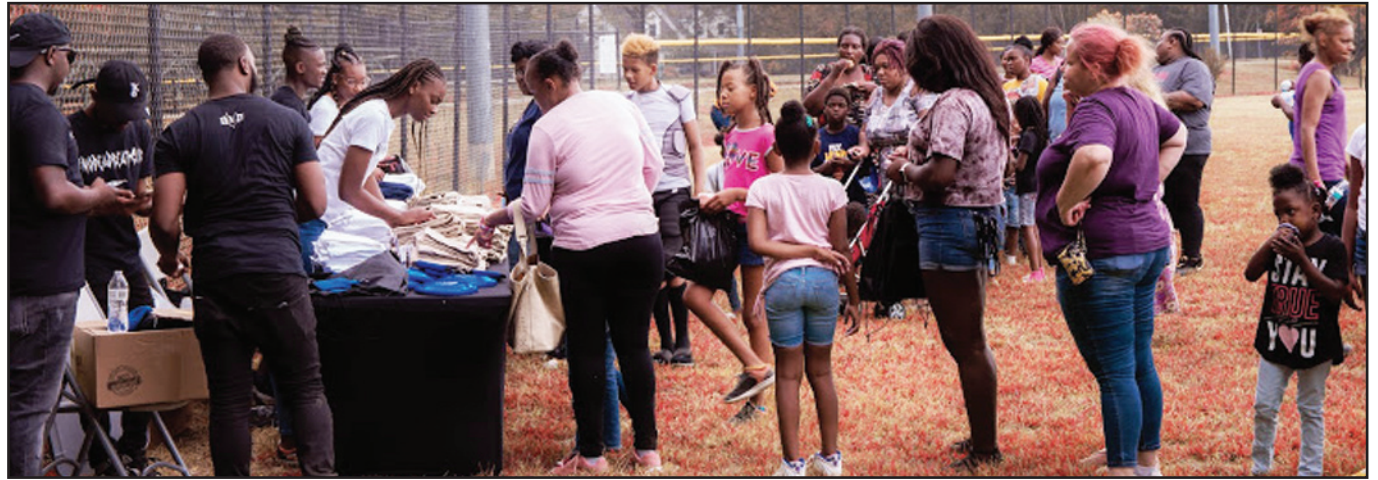
The “No Dead Beats Club Back To School Bash” was held at the Pip Moyer Recreation Center on August 25, 2019.