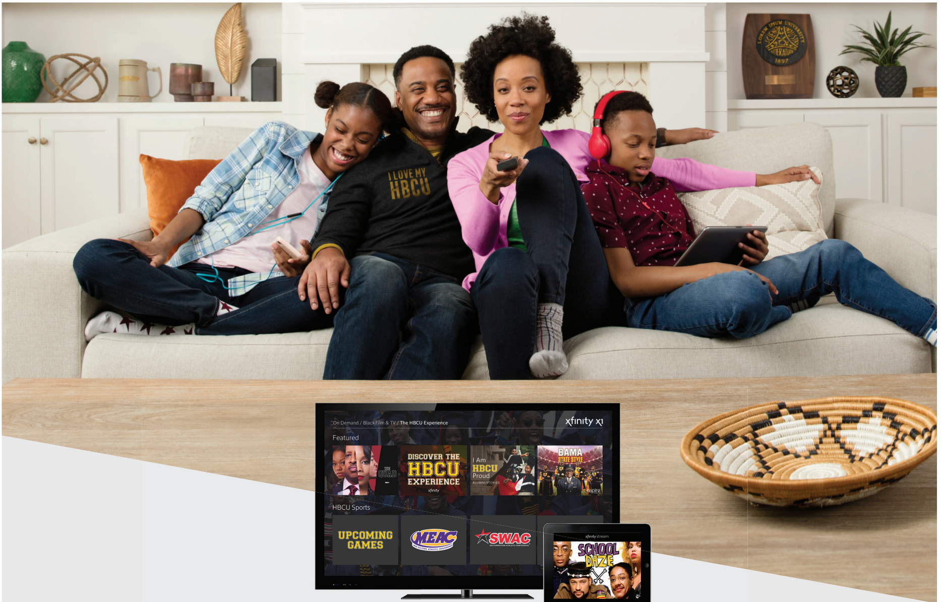
School Daze available to rent