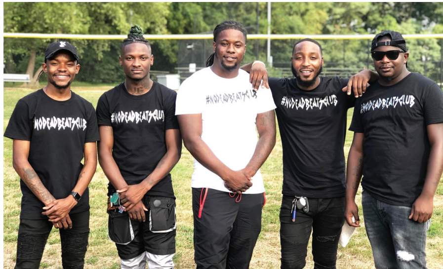
Men from the “No Dead Beats Club” pose in solidarity.