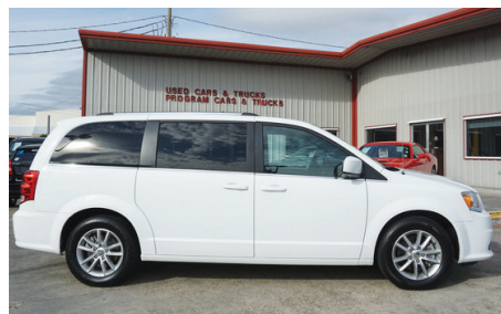
18 Dodge Caravan SXT