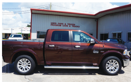
15 RAM 1500 Longhorn