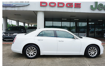
13 Chrysler 300C