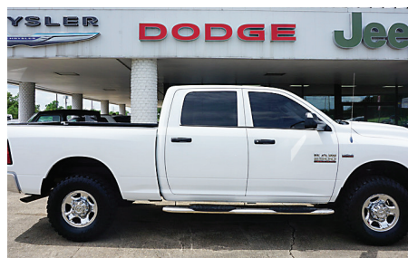
13 RAM 2500 Tradesman