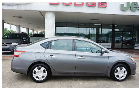
15 Nissan Sentra S