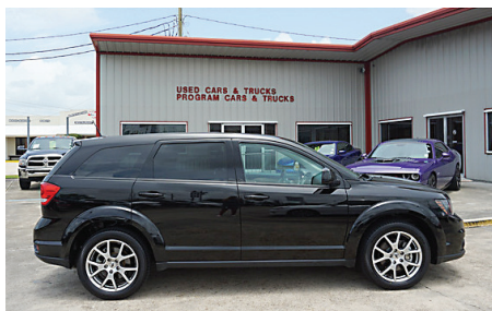
18 Dodge Journey GT