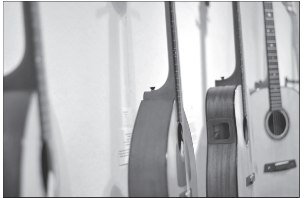
Instruments on display last year at the Harlow in Hallowell.

Hallowell is a featured city for Maine Craft Week-end this year, so visitors to Maine’s smallest city will also find displays and demonstrations featuring