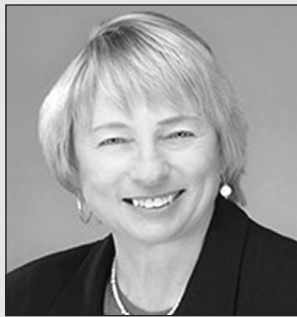
Governor Janet Mills