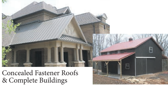
Concealed Fastener Roofs & Complete Buildings