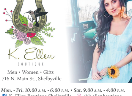
f K. Ellen Boutique Shelbyville @ @k.ellenboutique

TV'S, LAPTOPS, OR CELL-PHONES JUST LAYING AROUND? Advertise them for free at Exchange931.com to clear up space and make some money!