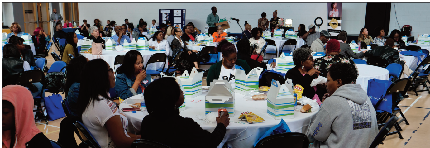
PNC Bank, Times Community Services, Inc. and The Baltimore Times hosted a Mind Your Business seminar in Coppin State University’s Physical Education Complex on Saturday, October 5, 2019. Over 100 entrepreneurs and aspiring entrepreneurs attended.

In addition to a panel discussion featuring leaders from various business groups, including the Mayor’s Office of Minority and Women-Owned Business Development and the Small Business Administration, the “Mind Your Business” event also included six breakout sessions that dove deeper into topics that typically impede business owners, such as financing, social media marketing, accounting, and legal issues.