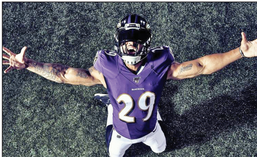
Baltimore Ravens safety Earl Thomas, considered a team leader, is looking to win back-to-back games against AFC North opponents. Last week, they beat the Pittsburgh Steelers and they hope to triumph over the Cincinnati Bengals on Sunday, October 13, 2019 at M&T Bank Stadium.

"A lot of things were going against us. Our guys kept their poise. Our guys didn't get overwhelmed by the moment. They found a way, ultimately to win the game," head coach John Harbaugh said. "Anytime you go into Heinz Field and get a win especially in this rivalry, that's a great accomplishment....Just another chapter in this incredible rivalry," Har-