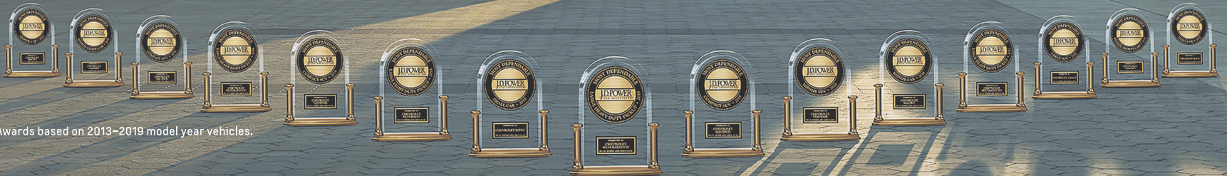
Awards based on 2013–2019 model year vehicles.

More than 448,000 owners were asked to rate the quality of their vehicles. And over the last four years, Chevy rose to the top across cars, trucks and SUVs. So over the long haul, driving a Chevy is a quality decision.