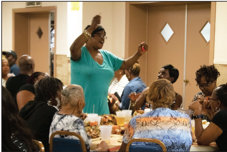
Attendee has a good time dancing at the table at the SAVE crab feast