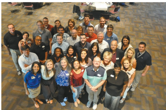
Excellence, made up of 34 area business professionals, is presented by Nucor Steel Decatur.

Equip is a leadership program for 8th grade students from across Morgan County exposing them to post-high school college and career opportunities in the skilled trades as well as programs that require less than a four-year degree. Equip is broken up