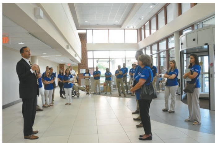
As part of the gathering focused on caring for the community, the Excellence group received a tour of Decatur Morgan Hospital and spoke with staff members about the role the hospital plays in the community.