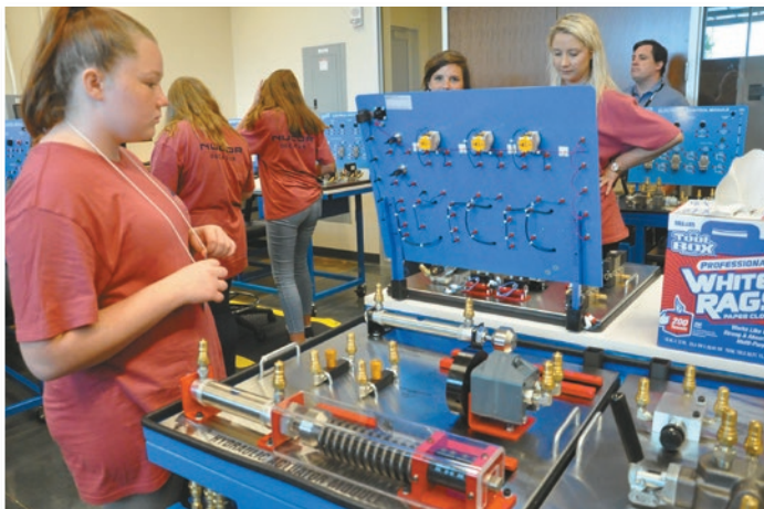
Members of Equip toured classrooms and labs at the Robotics Training Center as part of their most recent gathering.