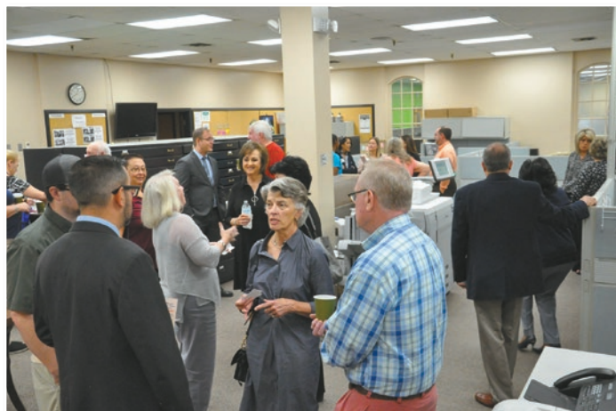
More than 40 members took part in the Coffee & Cards networking event hosted by The Decatur Daily in September.