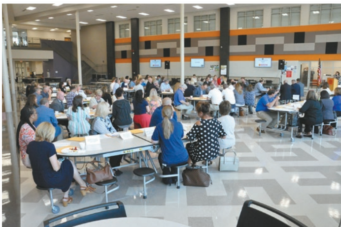
More than 150 education and business leaders from across Morgan County attended the Chamber's annual Partners in Education Kickoff Breakfast, this year presented by Redstone Federal Credit Union and held at Austin High School.