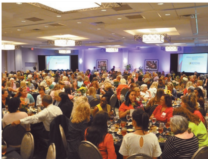
More than 340 people attended the Chamber’s 11th annual Women in Business Celebration, presented by Nucor Steel Decatur.