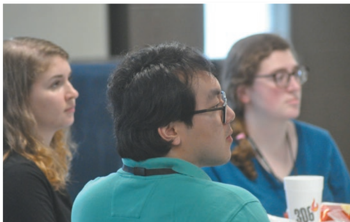
More than 30 young professionals from businesses and industry across Morgan County attended the August gathering of the YP Leadership Luncheon series.