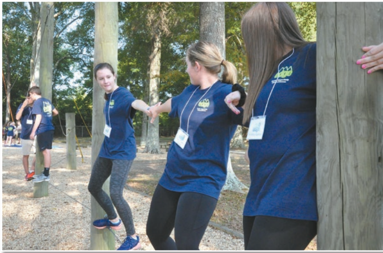
A successful ropes course experience required communication, teamwork and strategy – all themes of the Edge Student Leadership program.

of the training rooms, as well as the high-bay floor where robotics students practice their coding and programming projects on robots similar to what they would find in automotive manufacturing environments. Equip is presented by Nucor Steel Decatur , along with Day Sponsor Magnolia River .