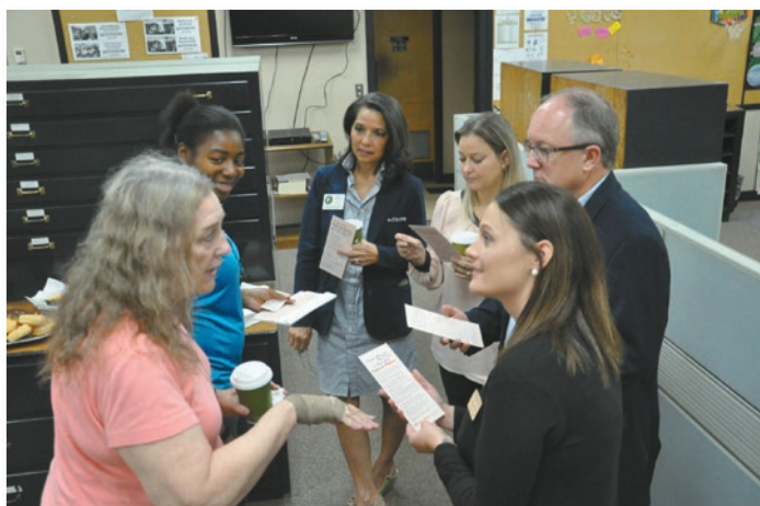
The goal of Chamber networking events is to provide opportunity and an environment for members to connect and grow their business.