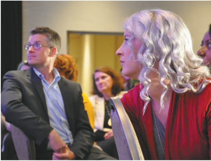
Business and community leaders from across north Alabama – more than 340 in total – attended the 11th annual Women in Business Celebration.