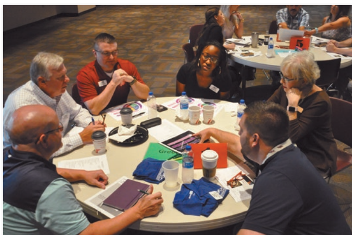
Excellence in Leadership class members took part in kickoff activities, including explanations of their Emergenetics profiles.