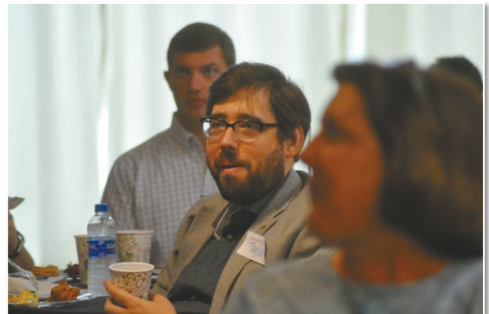
Presented quarterly by Redstone Federal Credit Union, Breakfast & Biz is a regular gathering of business professionals seeking out opportunities for professional and personal development while connecting with other members of our region's business community.