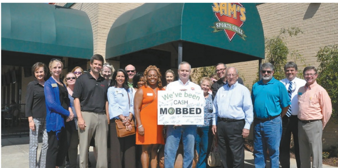
More than 25 business and community members joined the festivities for the Chamber’s inaugural Cash Mob.

hour, and more than 25 business and community members joined the festivities. The Chamber will continue to host Cash Mobs around Decatur-Morgan County, so please stay tuned to the Chamber’s social media and email platforms for our next announcement!