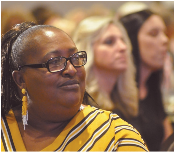
This was the 11th year for the Women in Business Celebration, this year held at the Doubletree by Hilton Decatur Riverfront.