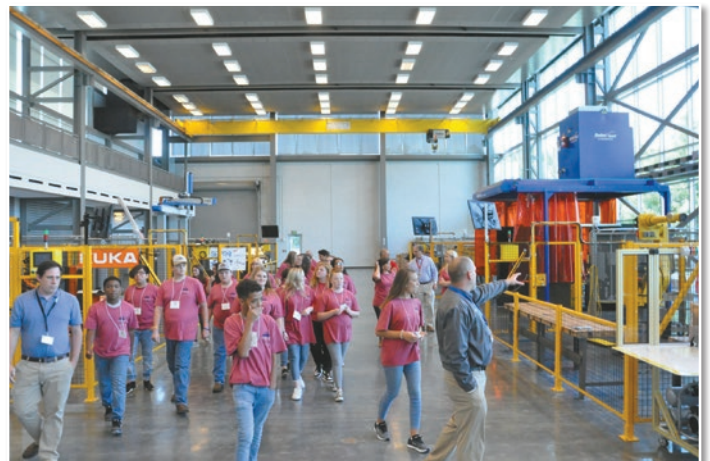
The Equip students were able to discuss with instructors the types of classes they would need to take in high school to continue work in robotics and automation.