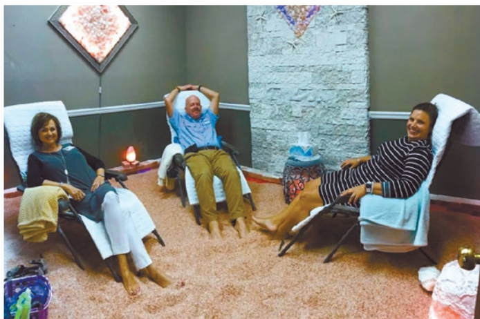
Sensations Massage and Body Clinic, who hosted the Chamber's networking event Business After Hours at their location in southwest Decatur, features a salt therapy room where customers with allergies can receive benefits of the treatment.