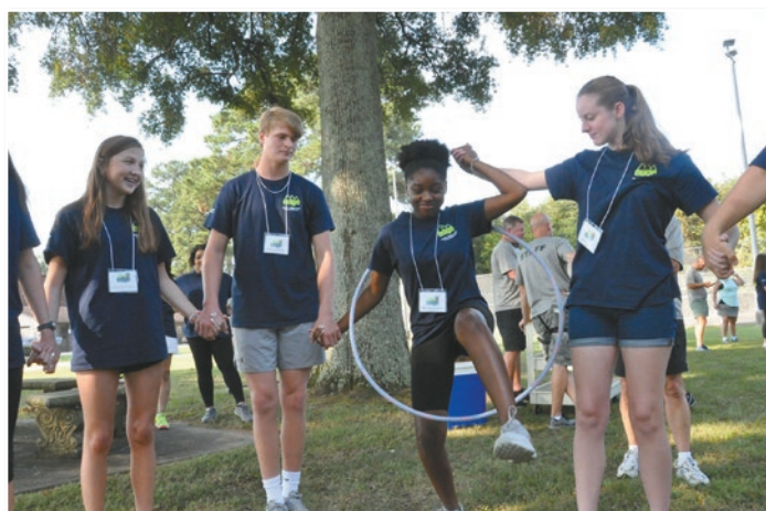
As part of their ropes course challenges, Edge Leadership members were required to develop strategies as a group that would help them achieve performance goals.