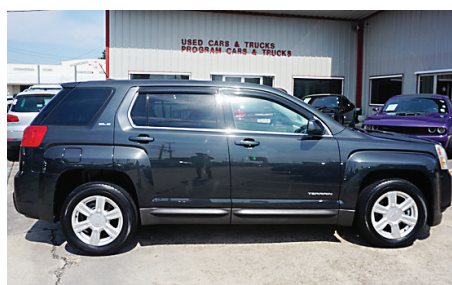
14 GMC Terrain SLE