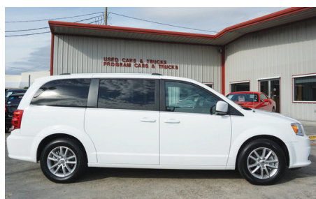
18 Dodge Caravan SXT