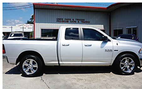
17 RAM 1500 SLT