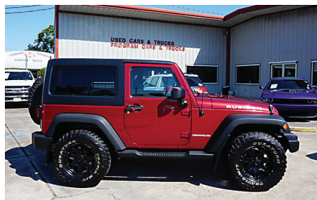
13 Jeep Wrangler Rubicon