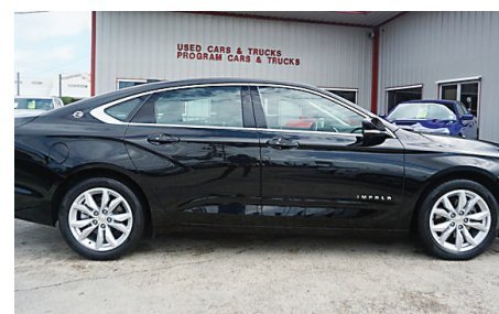
18 Chevrolet Impala LT