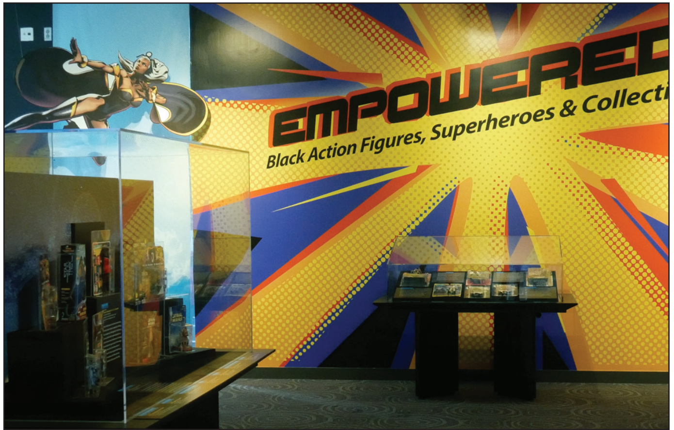
EMPOWERED! Black Action Figures, Superheroes & Collectibles exhibit opened in August and runs until February 23, 2020.