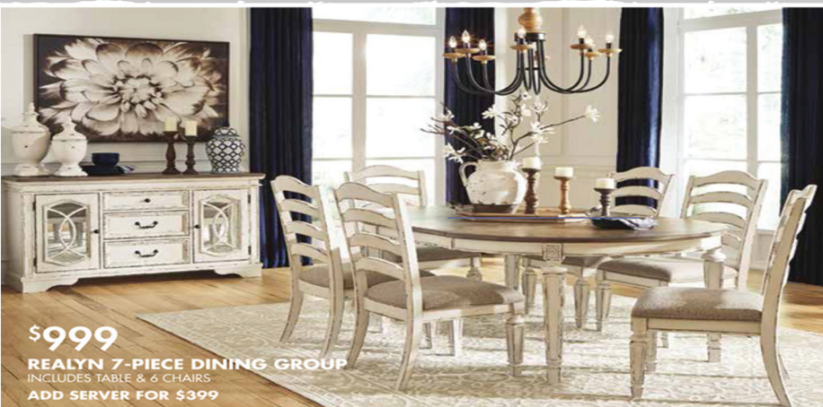
$999 REALYN 7-PIECE DINING GROUP INCLUDES TABLE & 6 CHAIRS ADD SERVER FOR $399

FREE TURKEY OR HAM WITH QUALIFYING PURCHASE FROM BROOKSHIRES IN GREENVILLE