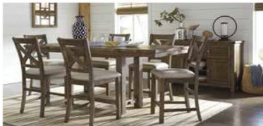
MORVILLE 7-PIECE DINING GROUP INCLUDES COUNTER HEIGHT TABLE & 6 STOOLS