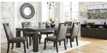
YOUR CHOICE $999 7-PIECE DINING GROUP