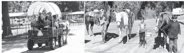
Autumn Trails brings Mom, Dad and the whole family to the Trail Ride!

Well, after viewing these scenes, I just had to tell somebody! I drove the short distance into Winnsboro. That's when I remembered it was Trail Ride Weekend! I caught up with two families who were enjoying the Western atmosphere. One family was in a wagon, with Mom driving the team of Friesian horses, with the kids lolling about in the back. They waved lazily as they passed me by. Also, I met another family, and their three children had just gotten back in from the trail ride and were walking their horses to get a drink of water when I came alongside. Everyone in Winnsboro is very friendly to visitors year-round, but especially during the month-long Autumn Trails festival of events during October every year. A new addition was the first-ever Cowboy Poetry Gathering, which was held on October 18 and 19, 2019. Watch for a return by cowboy entertainer Michael Martin Murphy and other excellent talent in the Cowboy and Western genre. Plan to attend in Winnsboro next October!