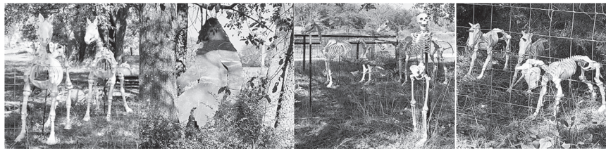
Look closely! There are Unicorns and other surprises here!

Well, after viewing these scenes, I just had to tell somebody! I drove the short distance into Winnsboro. That's when I remembered it was Trail Ride Weekend! I caught up with two families who were enjoying the Western atmosphere. One family was in a wagon, with Mom driving the team of Friesian horses, with the kids lolling about in the back. They waved lazily as they passed me by. Also, I met another family, and their three children had just gotten back in from the trail ride and were walking their horses to get a drink of water when I came alongside. Everyone in Winnsboro is very friendly to visitors year-round, but especially during the month-long Autumn Trails festival of events during October every year. A new addition was the first-ever Cowboy Poetry Gathering, which was held on October 18 and 19, 2019. Watch for a return by cowboy entertainer Michael Martin Murphy and other excellent talent in the Cowboy and Western genre. Plan to attend in Winnsboro next October!