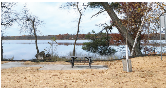
An attractive picnic area is complete with new landscaping.

Eligible for an historical listing, the original 22 ft. diameter stone council ring with five ft. diameter fire ring and stone overlook on the Hickory Lake side were constructed in 1938.