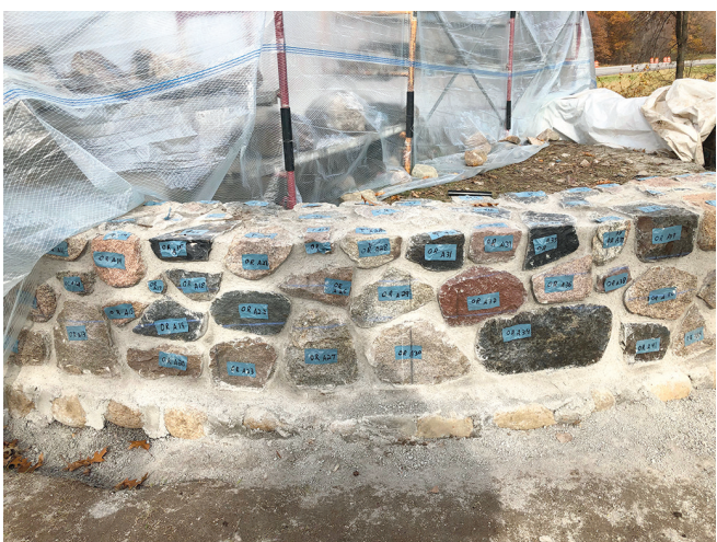
The remaining council ring with firepit was in fair condition. Over the years it has been patched with mortar and needed repair. Rocks were carefully numbered for restoration work.