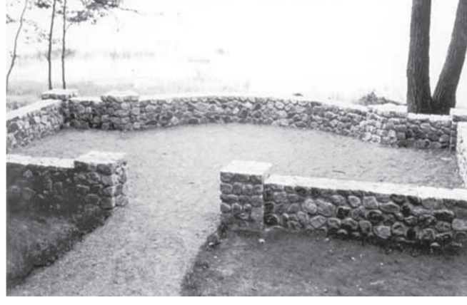
The Hickory Lake stone overlook, circa 1938.

yards for a wading pool. It is likely that the Pine-Hickory Lakes Roadside Parking Area was designed by Arthur R. Nichols of the firm Morell and Nichols. Nichols served as Consulting Landscape Architect for the Minnesota Department of Highways in the 1930's and designed most roadside development structures built during this period. The structures were built by the National Youth Administration.