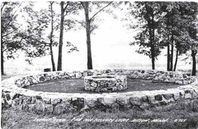
One of the original stone council rings with fire ring in center.

By ANN SCHWARTZ Locals remember playing ball and sitting around campfires at the wayside rests known as Pine-Hickory. The rest stops are located on both sides of Hwy. 169 just about six miles south of Aitkin on Hickory Lake to the east and Little Pine Lake on the west of the highway.