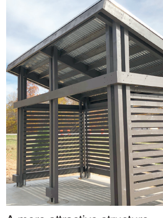
A more attractive structure will hide the portable toilets.

Over the years, one council ring, nine fireplaces, a well, a rustic footbridge, a rustic guardrail, and a marker were removed from the site. A restoration project is now nearly done on the west side of Hwy. 169, with a new paved parking lot, toilet