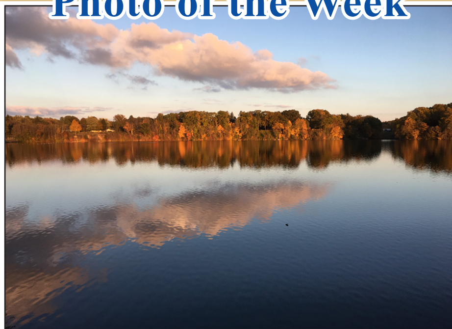
Reflecting Fall

Please email your favorite photo with a brief description to Photos@MailMaxOnline.com Photos must be horizontal orientation to be considered for Photo of the Week.