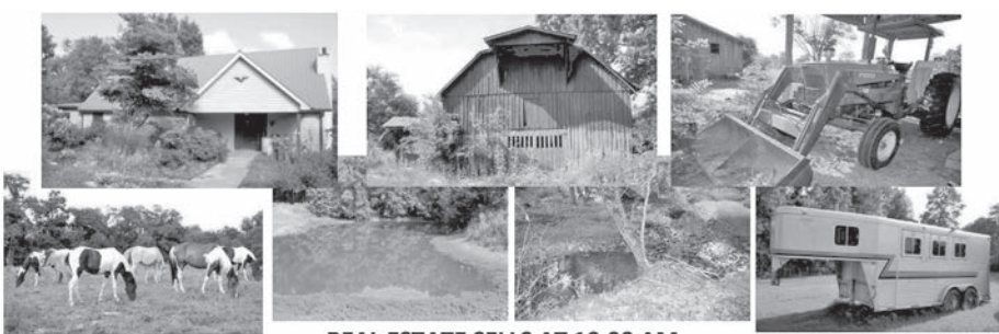
REAL ESTATE SELLS AT 10:00 AM

APPROX. 111 ACRE FARM IN 3 TRACTS WITH 3 BEDROOM HOME, BARN, CREEK, 2 PONDS, FARM EQUIPMENT, WOODWORKING TOOLS, FURNITURE, AND 9 HORSES.