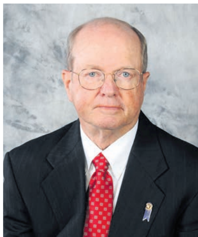
"Progress through Experienced Leadership" (931) 247-5113 rknowis@theknowisgroup.com