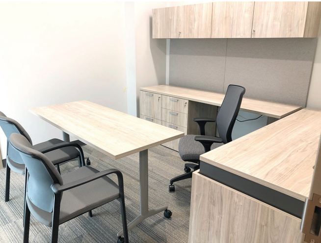
The color scheme is muted tones of gray and beige with wood accents.

monitors to watch the meeting on. Seibert noted that when the entrances and sidewalks are done, there will be a lighted blue line installed at the entrance in memory of Steve Sandburg, slain sheriff's deputy.