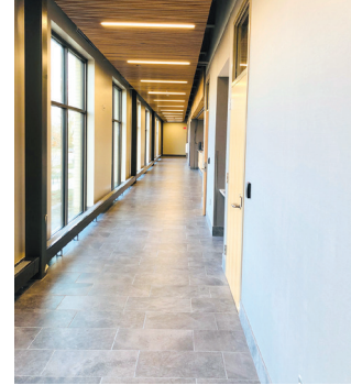
One long, public hallway on each floor accesses key services.