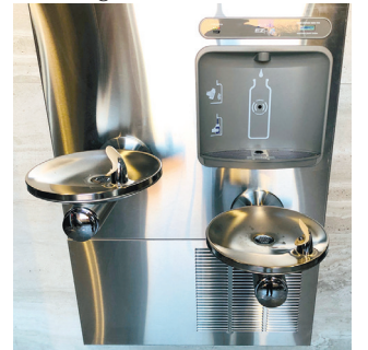
Shiny new drinking fountains and bottle-filling stations will ensure hydration for guests and staff.

There are also small conference rooms where customers can have a private meeting with staff to discuss their issues, or staff can hold meetings.