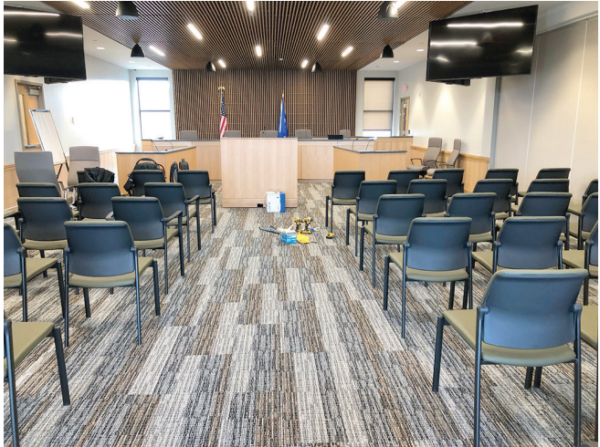
The new county board room has ample seating for the public, a great sound systems and a television monitor to watch board proceedings.

west end of the government center. Second floor includes environmental services, surveying and GIS. The 4-H office is also there, with plenty of room for storage. Third floor houses administration, economic devel-