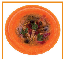
SCENTED WAX VESSELS