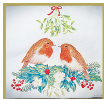
FLOUR SACK TOWELS