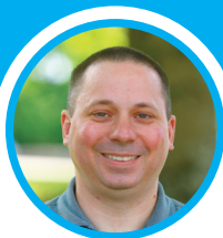
Todd Pitts Creative Services