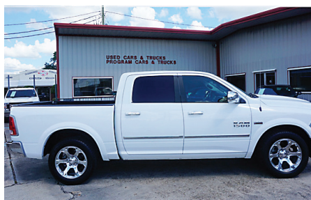
16 RAM 1500 Laramie