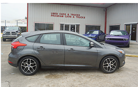
18 Ford Focus SEL