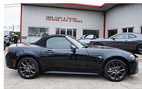
17 Fiat 124 Spider Elaborazione Abarth