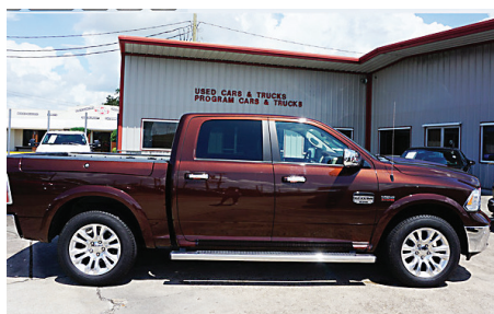
15 RAM 1500 Longhorn