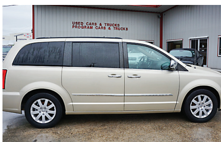
11 Chrysler Town & Country Touring L