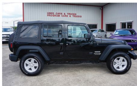
18 Jeep Wrangler JK