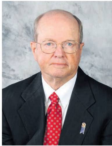
"Progress through Experienced Leadership" (931) 247-5113 rknowis@theknowisgroup.com