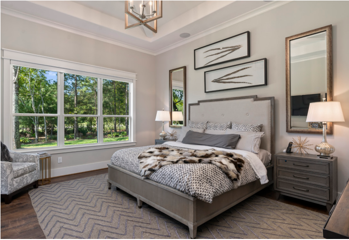
Continued from page 5

that our clients are not settling on anything and that their investment will be everything they imagined. No matter what their vision, style or budget, we have the diversity of experience to achieve their dream home with the highest standard of quality and value," they state on their website.