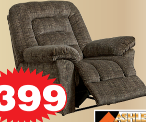
Ashley Big Man's Wallaway Recliner