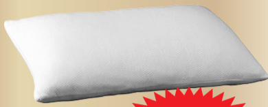
Ashley Queen Size Memory Foam Pillow