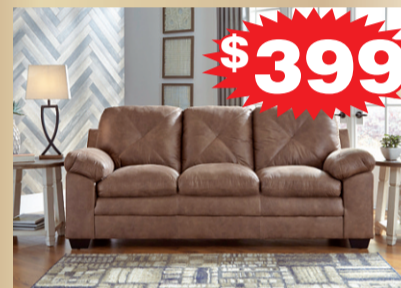
Ashley Transitional Sofa