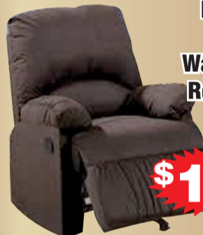
Micro Fiber Wallaway Recliner