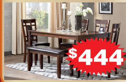
Ashley 6-Piece Dinette with Bench