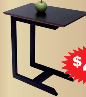
TEI Snack Table