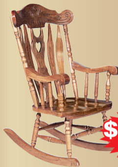
TEI Oak Wood Rocker