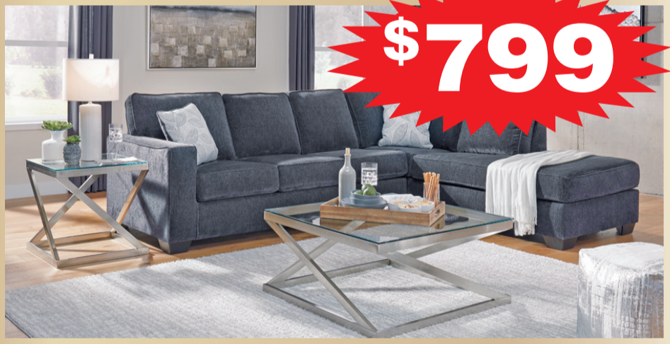
2-Piece Ashley Chaise Sectional