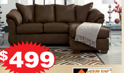
Ashley Chaise Sofa (Available in 8 Colors)