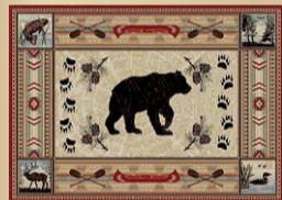
Rustic Room Size Rugs