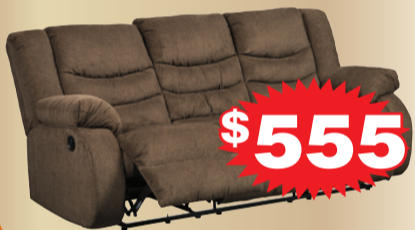
Ashley Tulen Reclining Sofa