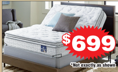
Queen Size Adjustable Bed Featuring Pillow Top Mattress