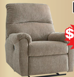
Ashley Power Recliner