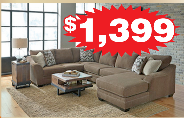
Ashley 3-Piece Sectional