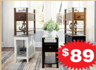
Ashley Power End Tables