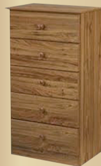
Lang 5-Drawer Chest