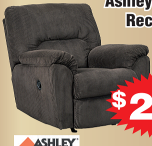
Ashley Rocker Recliner