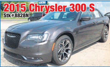
2015 Chrysler 300 S Stk #8828N

MSRP - $33,685 Discounts & Rebates - $3,165 $30,520