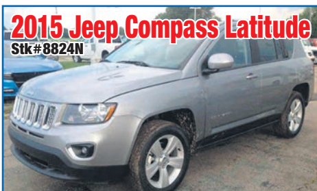
2015 Jeep Compass Latitude Stk #8824N

MSRP - $24,925 Discounts & Rebates - $2,394 $22,531