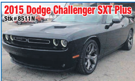
2015 Dodge Challenger SXT Plus Stk #8511N

MSRP - $34,975 Discounts & Rebates - $1,375 $33,600