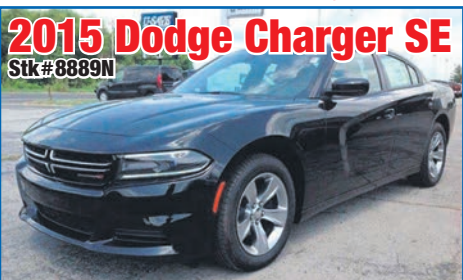
2015 Dodge Charger SE Stk #8889N

MSRP - $33,990 Discounts & Rebates - $2,261 $31,729