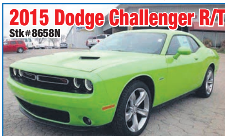
2015 Dodge Challenger R/T Stk #8658N

MSRP - $37,560 Discounts & Rebates - $3,774 $33,786