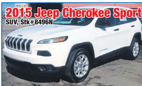
2015 Jeep Cherokee Sport SUV, Stk #8496N

MSRP - $29,985 Discounts & Rebates - $2,993 $26,992