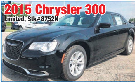
2015 Chrysler 300 Limited, Stk #8752N

MSRP - $26,350 Discounts & Rebates - $4,279 $22,071