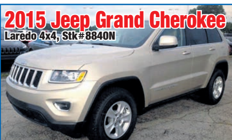
2015 Jeep Grand Cherokee Laredo 4x4, Stk #8840N

MSRP - $25,480 Discounts & Rebates - $3,782 $21,698