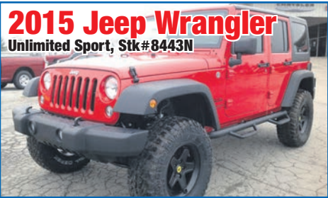
2015 Jeep Wrangler Unlimited Sport, Stk #8443N

MSRP - $28,295 Discounts & Rebates - $782 $27,513