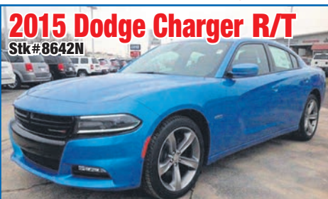
2015 Dodge Charger R/T Stk #8642N

MSRP - $32,775 Discounts & Rebates - $2,007 $30,768