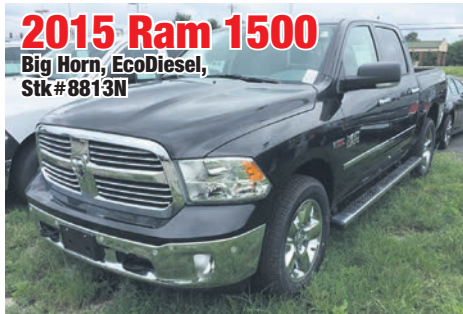
2015 Ram 1500 Big Horn, EcoDiesel, Stk #8813N

MSRP - $42,880 Discounts & Rebates - $6,423 $36,457