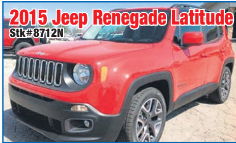
2015 Jeep Renegade Latitude Stk #8712N

MSRP - $22,960 Discounts & Rebates - $3,702 $19,258