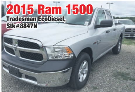
2015 Ram 1500 Tradesman EcoDiesel, Stk #8847N

MSRP - $42,245 Discounts & Rebates - $5,098 $37,147