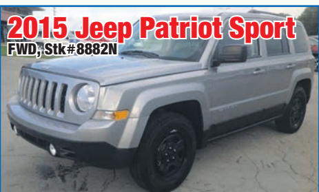
2015 Jeep Patriot Sport FWD, Stk #8882N

MSRP - $34,990 Discounts & Rebates - $1,745 $33,245