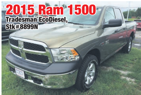
2015 Ram 1500 Tradesman EcoDiesel, Stk #8899N

MSRP - $42,245 Discounts & Rebates - $5,098 $37,147