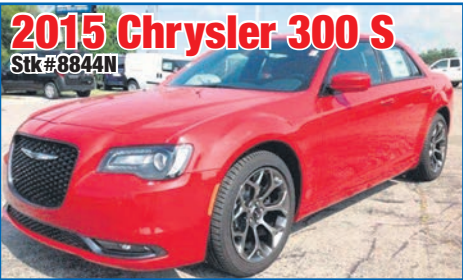
2015 Chrysler 300 S Stk #8844N

MSRP - $37,060 Discounts & Rebates - $3,719 $33,341