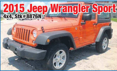
2015 Jeep Wrangler Sport 4x4, Stk #8876N

MSRP - $22,280 Discounts & Rebates - $826 $21,454