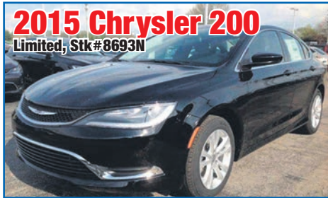
2015 Chrysler 200 Limited, Stk #8693N

MSRP - $26,350 Discounts & Rebates - $4,279 $22,071