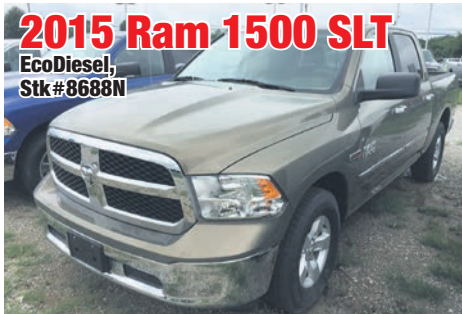
2015 Ram 1500 SLT EcoDiesel, Stk #8688N

MSRP - $37,465 Discounts & Rebates - $4,689 $32,776