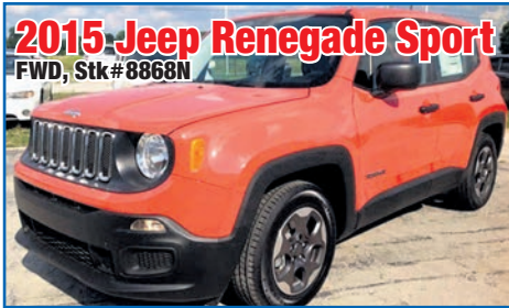
2015 Jeep Renegade Sport FWD, Stk #8868N

MSRP - $24,780 Discounts & Rebates - $1,262 $23,518